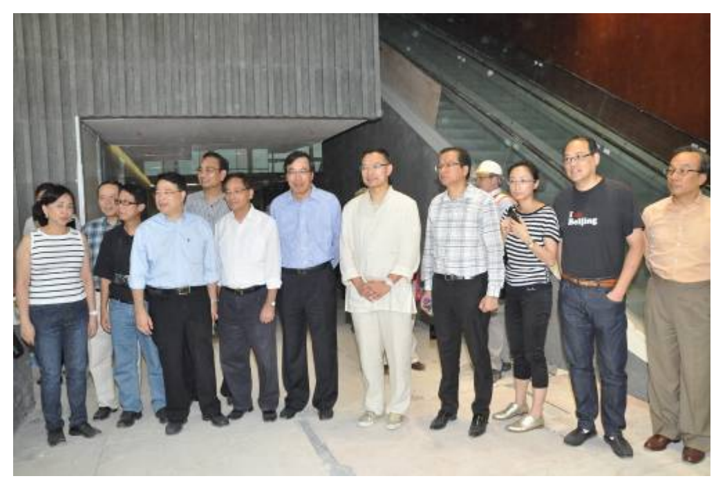
Members take a group photo at the lobby of the Members' Entrance.