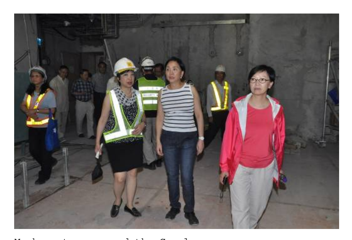
Members tour around the Complex.