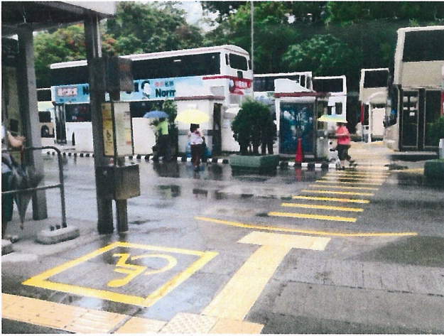
房委會物業 - 沙田新田圍邨的交通交匯處(巴士站)完成的無障礙設施 (2012年5月15日)