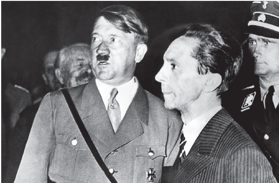
Adolf Hitler & Joseph Goebbels.

light quality as incandescent bulbs, use less energy, and are good for the planet—you are the victim of another evil EU force, the spirit of Goebbels.