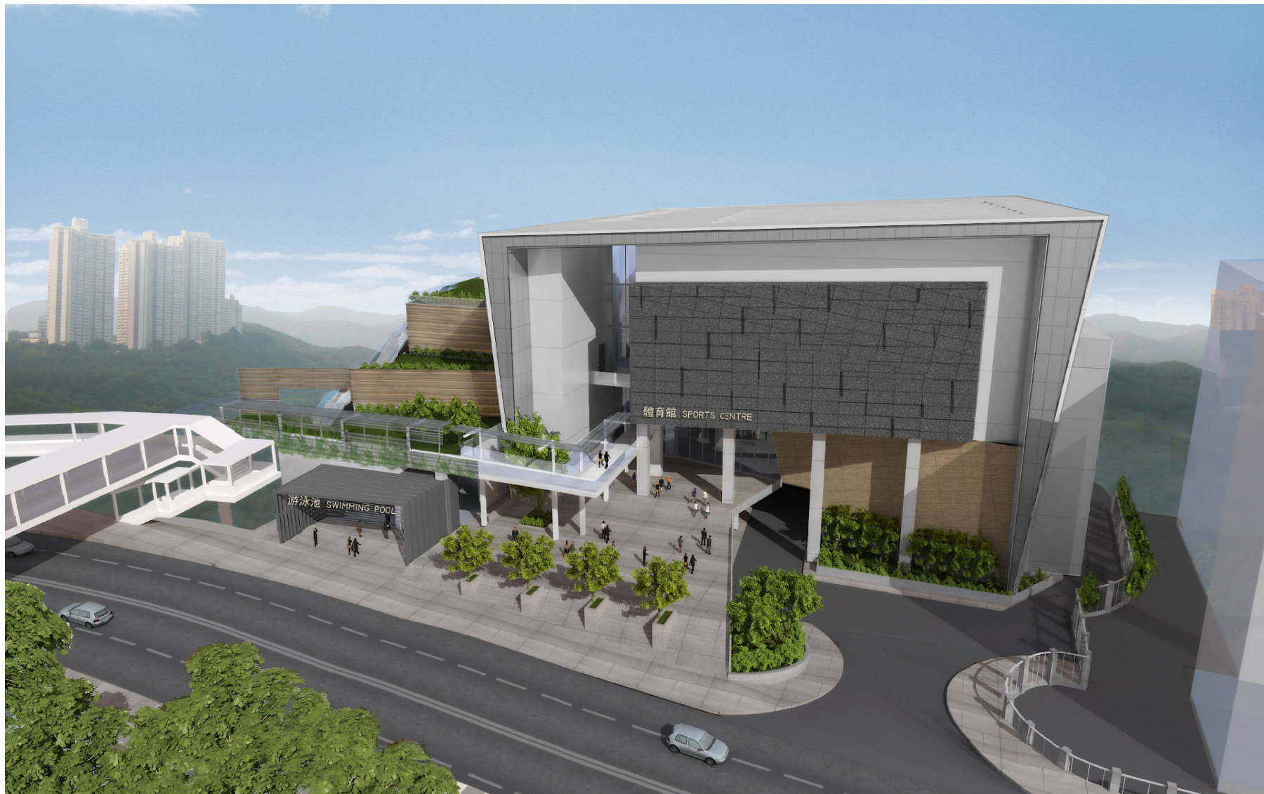
從南面望向大樓的構思透視圖 PERSPECTIVE VIEW FROM SOUTHERN DIRECTION (ARTIST'S IMPRESSION)