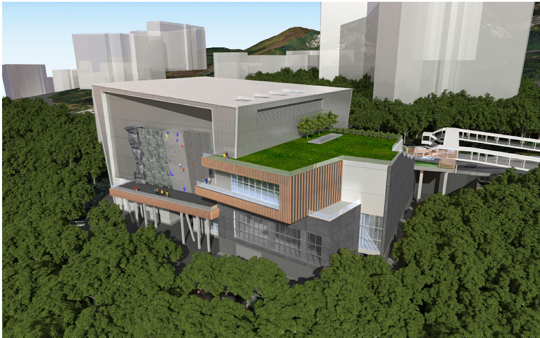
從西北面望向大樓的構思透視圖 PERSPECTIVE VIEW FROM NORTHWESTERN DIRECTION (ARTIST'S IMPRESSION)