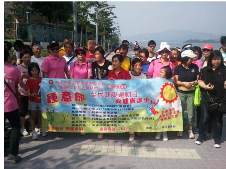
I'm So Smart Health Promotion Community Programme