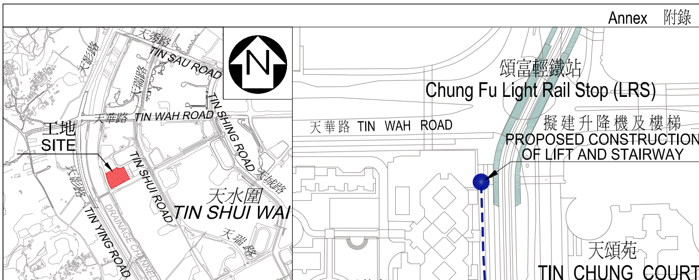
位置圖 LOCATION PLAN