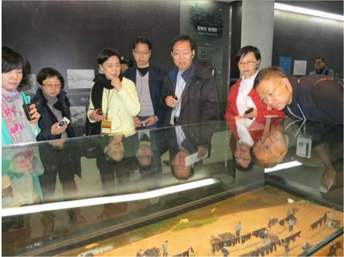
The delegation visits the Cheonggyecheon Museum.