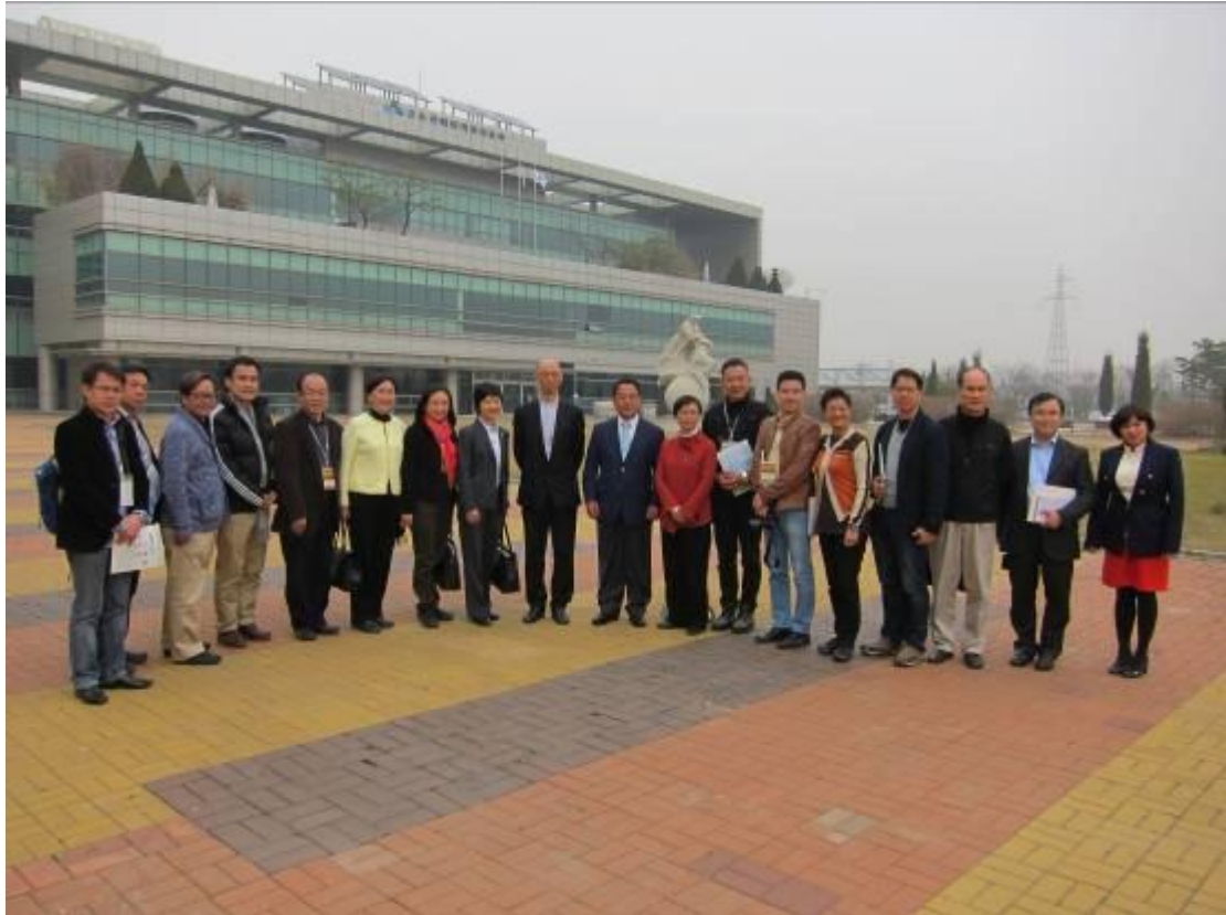
The delegation takes a group photo at the Sudokwon landfill.