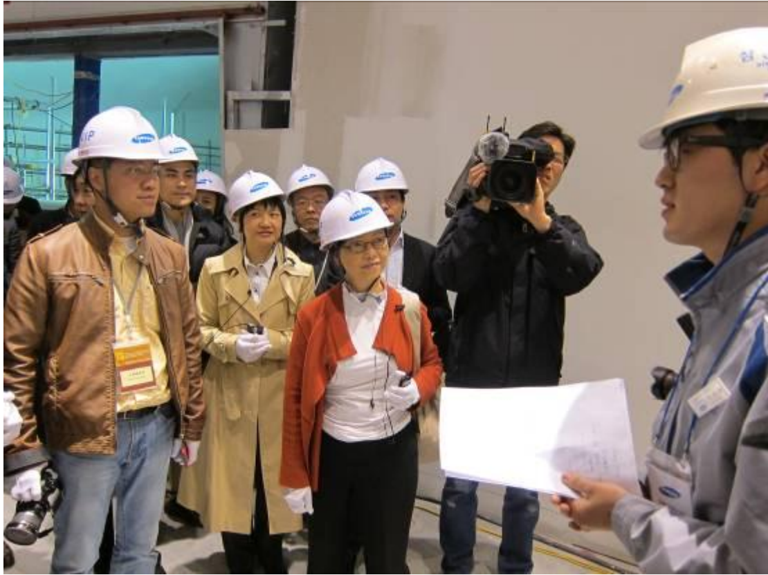
Members of the delegation receive a briefing on the construction waste management strategy of Samsung C&T.