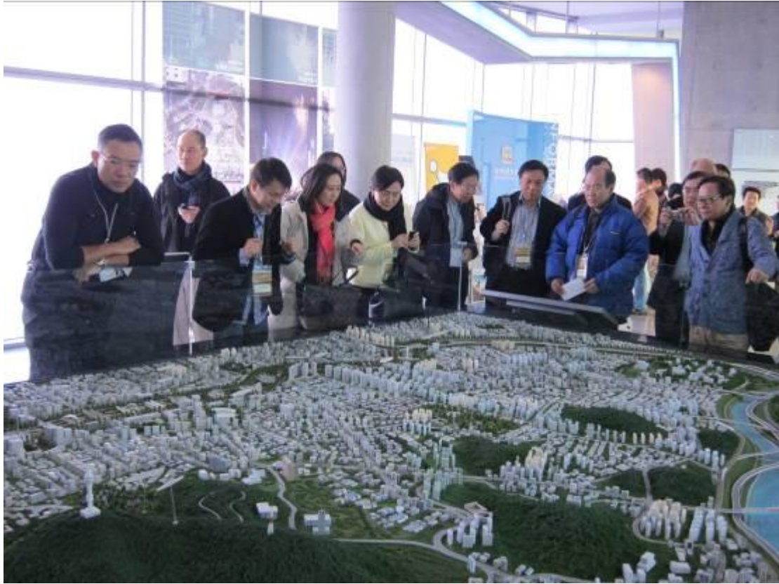
The delegation observes a model of the Cheonggyecheon restoration project.