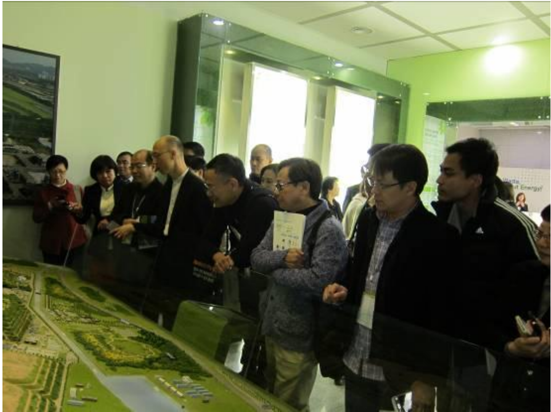
The delegation visits the Sudokwon landfill.