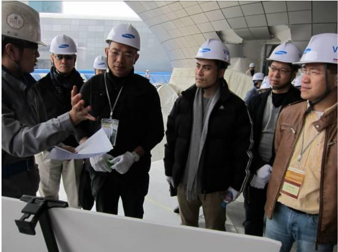
The delegation conducts a site tour at Samsung C&T.