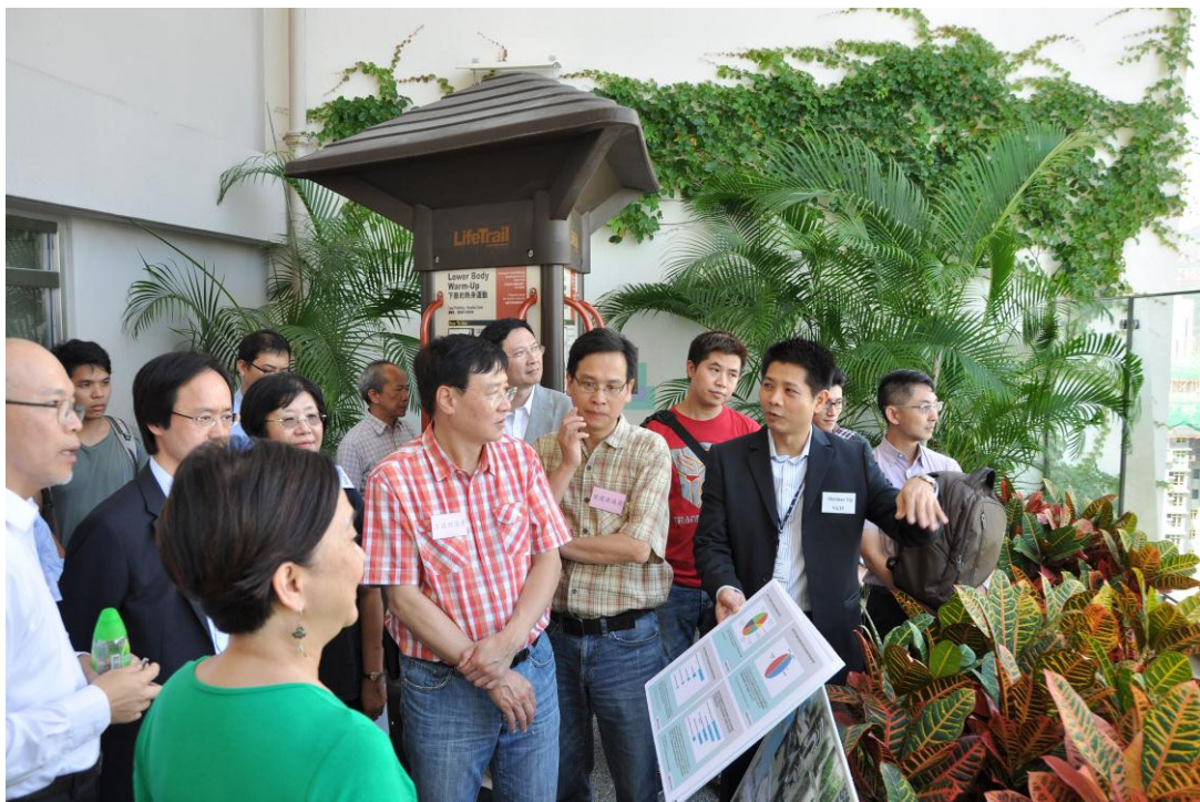
LegCo Members visit a communal terrace on the 33 rd floor at Kwai Luen Estate, Kwai Chung.