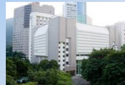
The Queen Elizabeth Stadium 香港伊利沙伯體育館