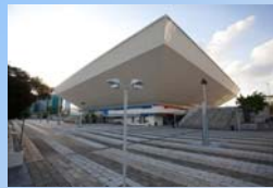
The Hong Kong Coliseum 香港體育館