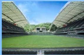
The Hong Kong Stadium 香港大球場