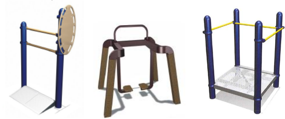
(b) for adults' use