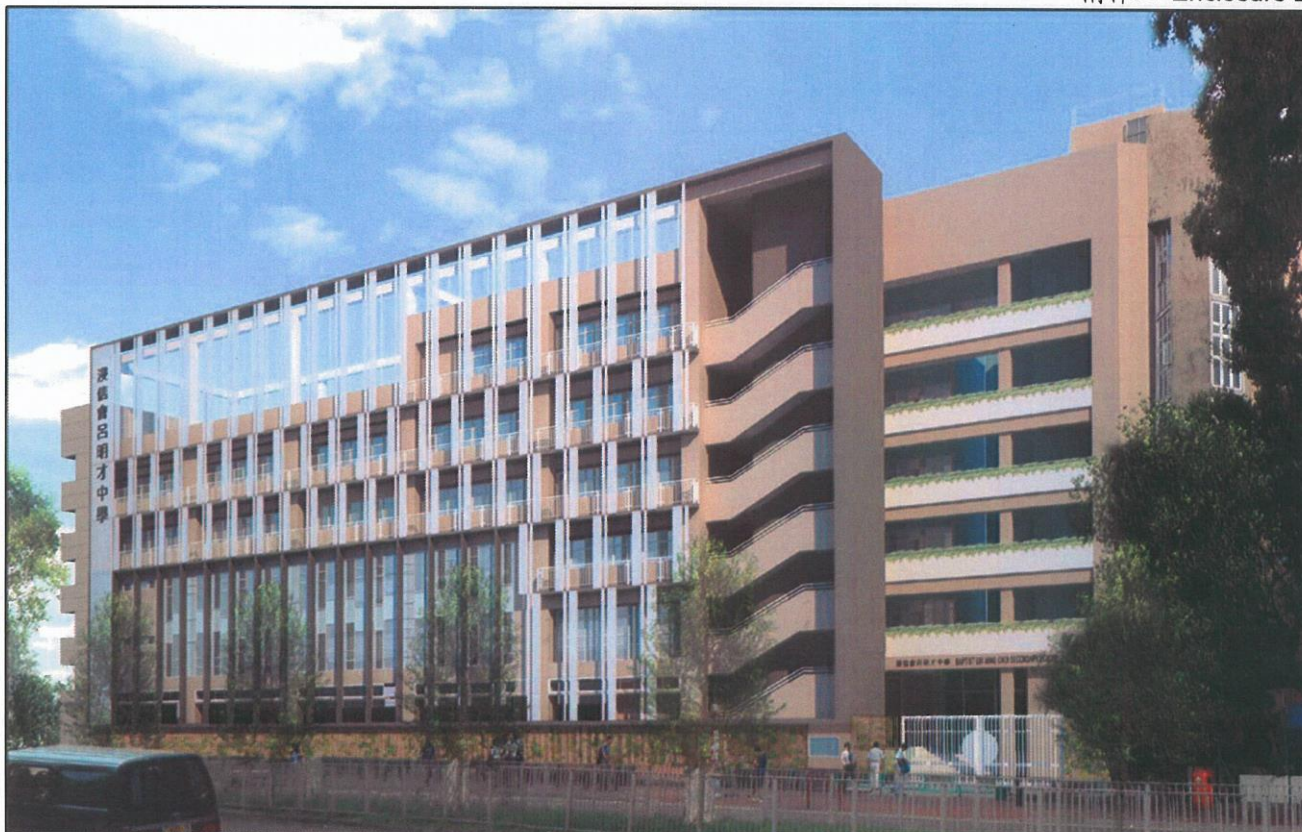
VIEW OF THE NEW ANNEX FROM YUEN WO ROAD (ARTIST'S IMPRESSION) 從源禾路望向新翼大樓構思圖