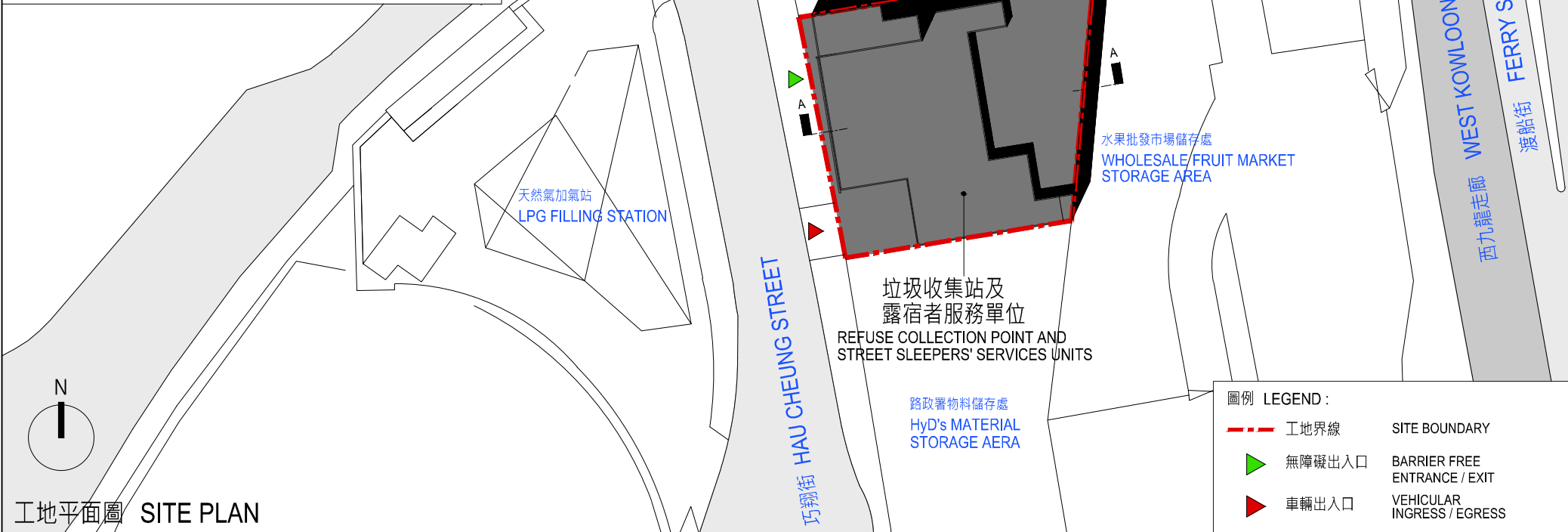
工地平面圖 SITE PLAN