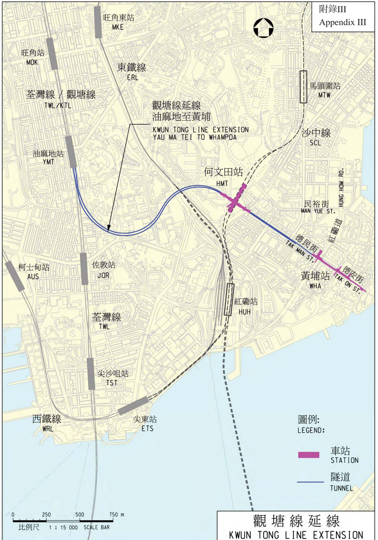
觀塘線延線 KWUN TONG LINE EXTENSION