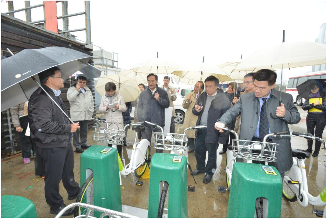
Members observe the automated bicycle rental system to be launched as a pilot scheme within the West Kowloon Cultural District site.