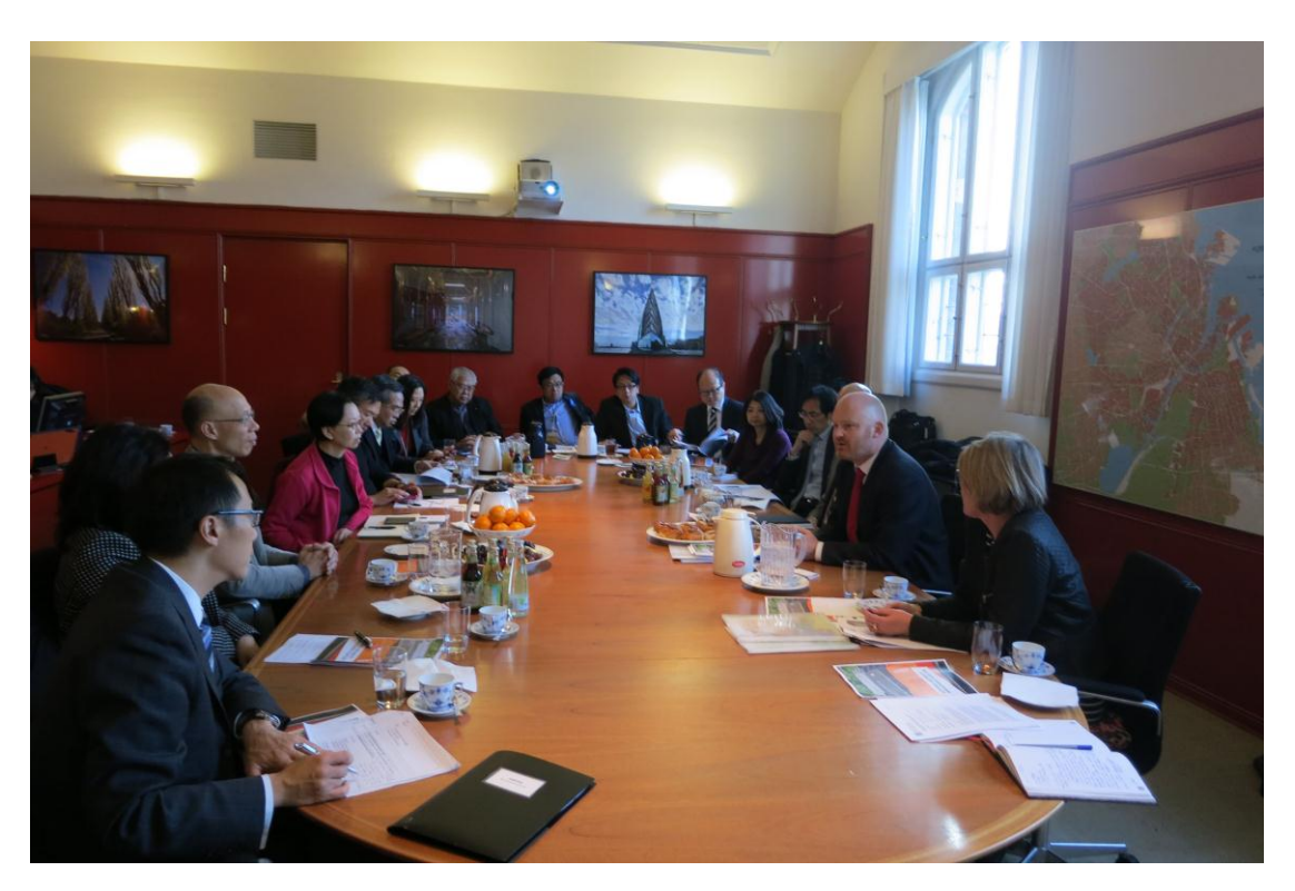
Ends/Friday, March 7, 2014 NNNN

Members of the delegation exchange views with the Technical and Environmental Mayor of Copenhagen on waste management.