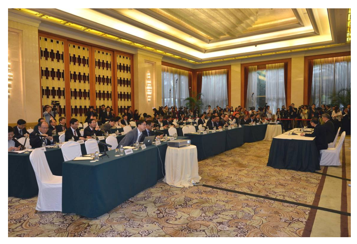
The Legislative Council Delegation on duty visit to Shanghai receives a briefing on the latest developments of China's foreign policy conducted by Mr QU Xing.