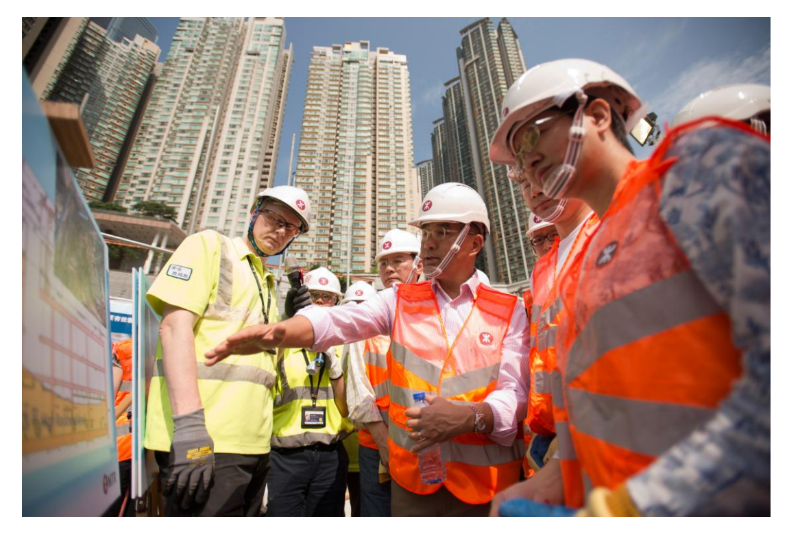
Members receive a briefing from the representatives of the MTR Corporation Limited on the latest progress of the works.