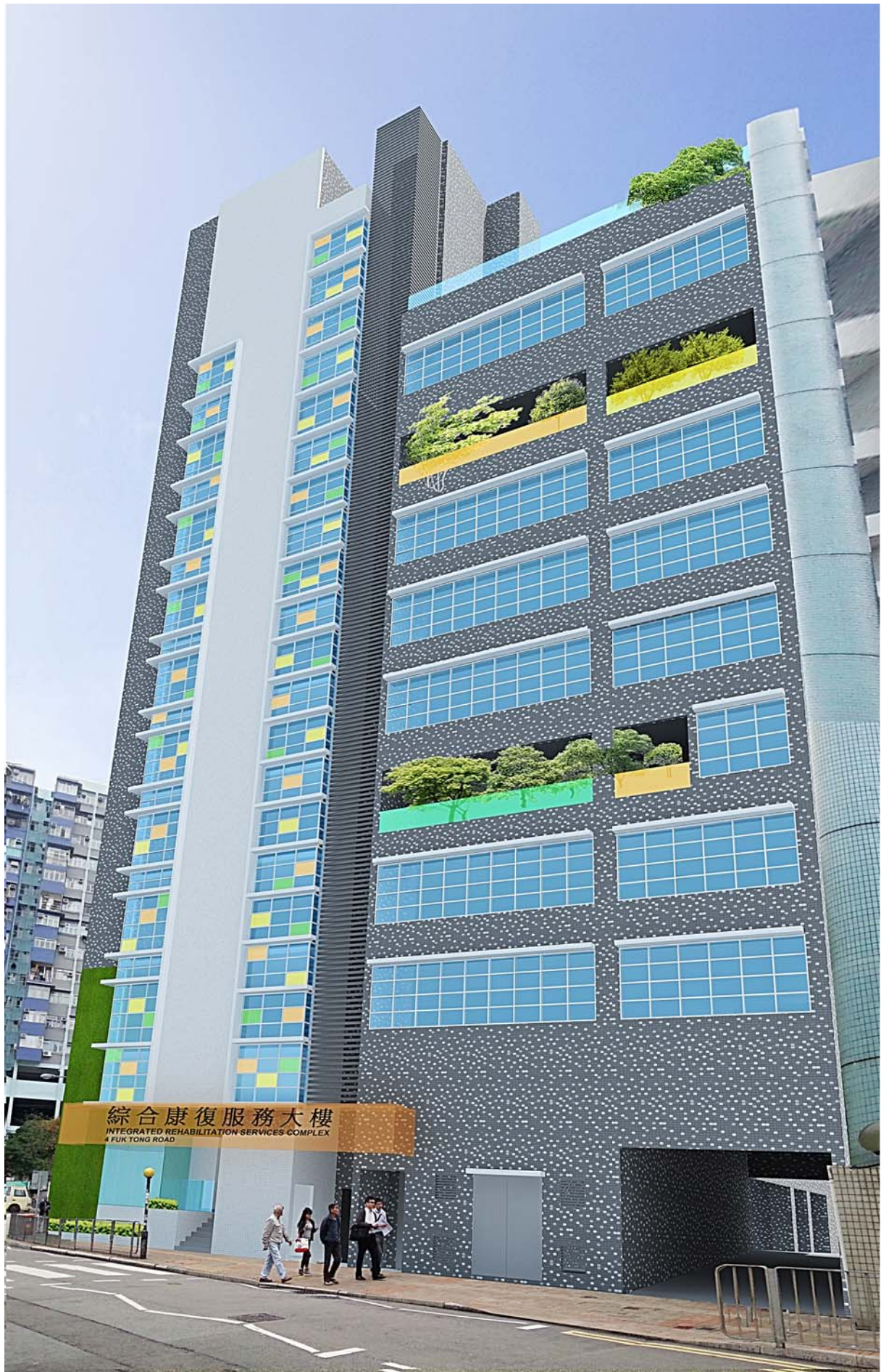
Perspective View from Fuk Tong Road