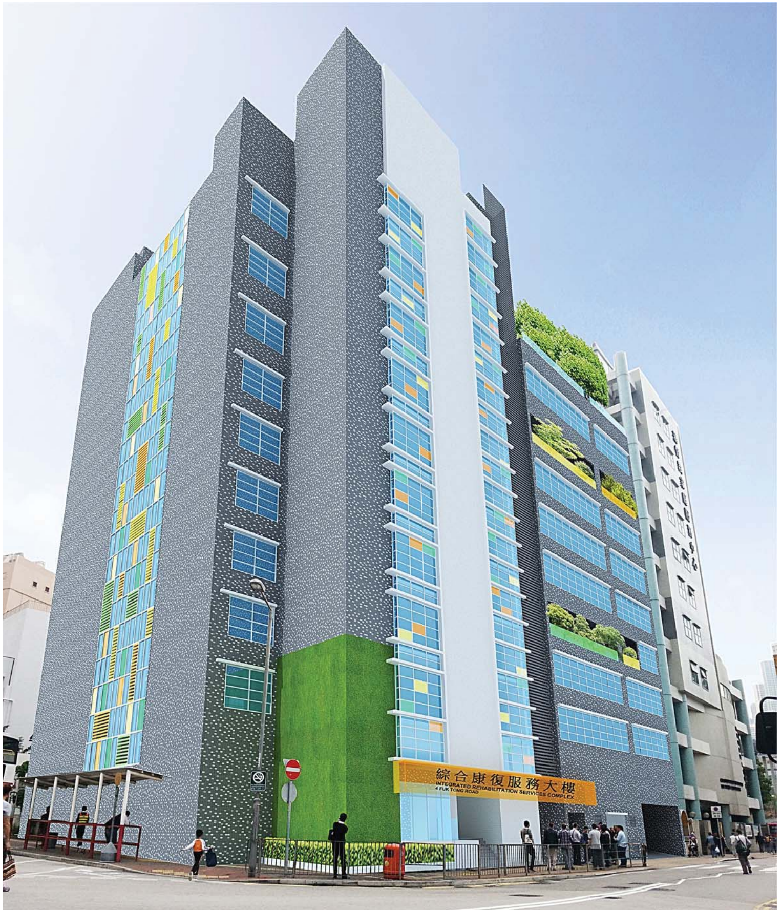
Perspective View from Bus Terminus