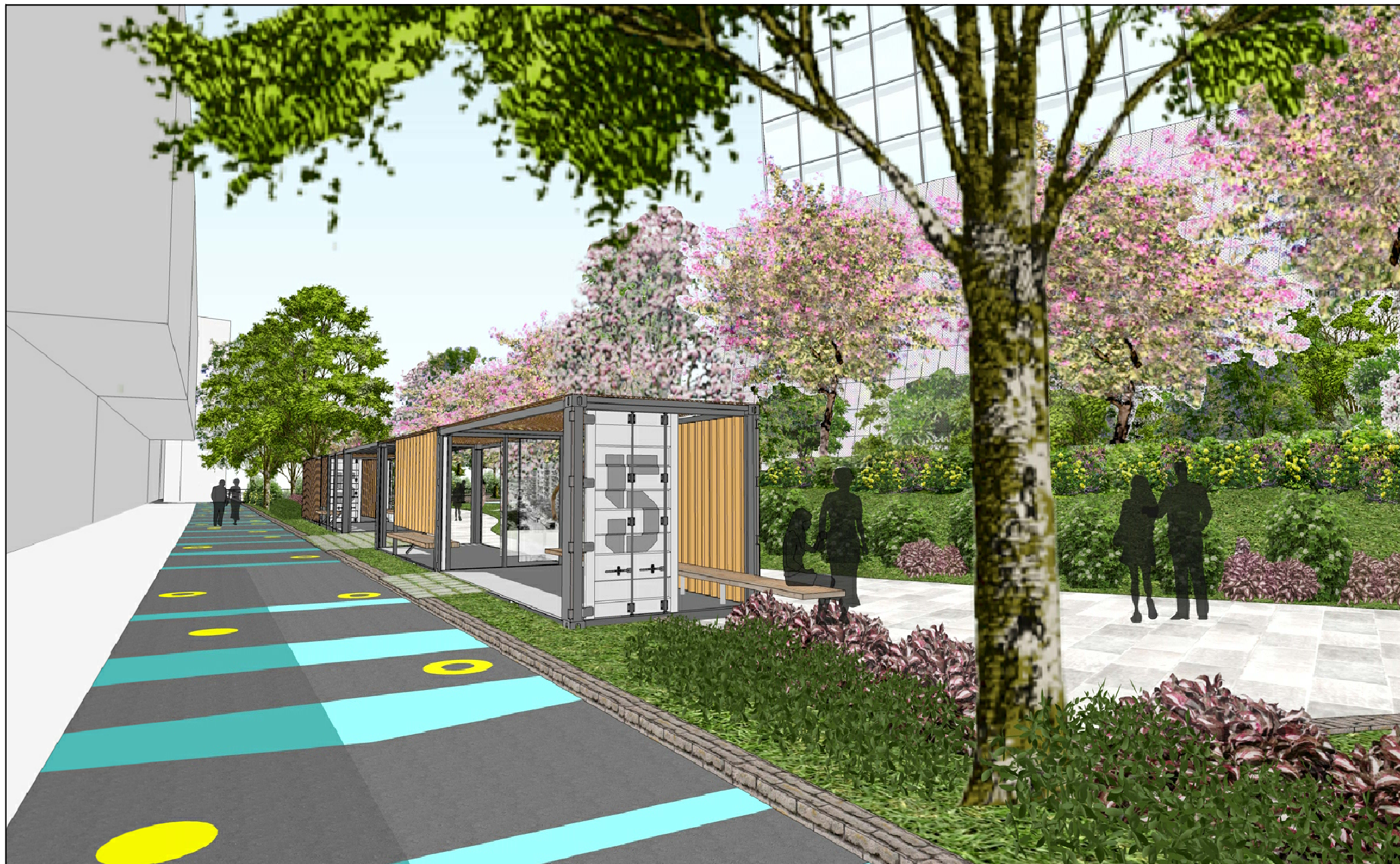
從鄰近街道望向公園的構思圖 VIEW FROM ADJACENT STREET (ARTIST'S IMPRESSION)

PROJECT TITLE 項目名稱 450RO 改建駿業街遊樂場為觀塘工業文化公園 CONVERTING TSUN YIP STREET PLAYGROUND AS KWUN TONG INDUSTRIAL CULTURE PARK