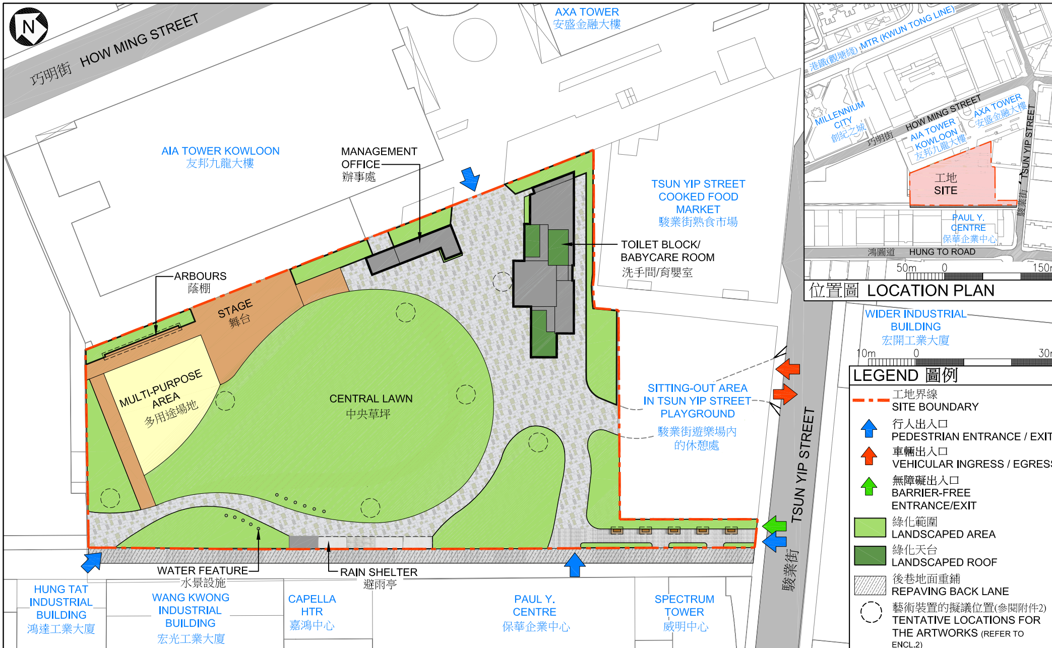
工地平面圖 SITE PLAN

PROJECT TITLE 項目名稱 450RO 改建駿業街遊樂場為觀塘工業文化公園 CONVERTING TSUN YIP STREET PLAYGROUND AS KWUN TONG INDUSTRIAL CULTURE PARK