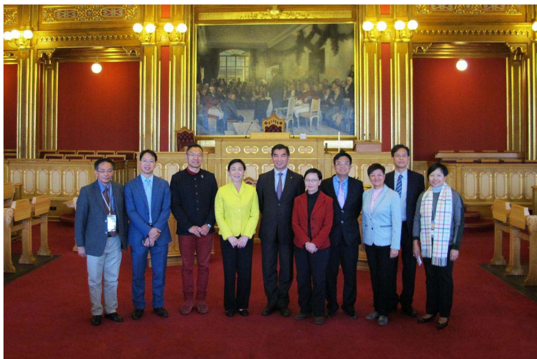
Visit to the Chamber of the Storting building