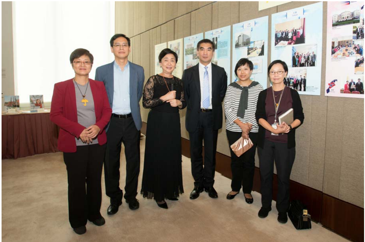
Group photo taken after the media briefing