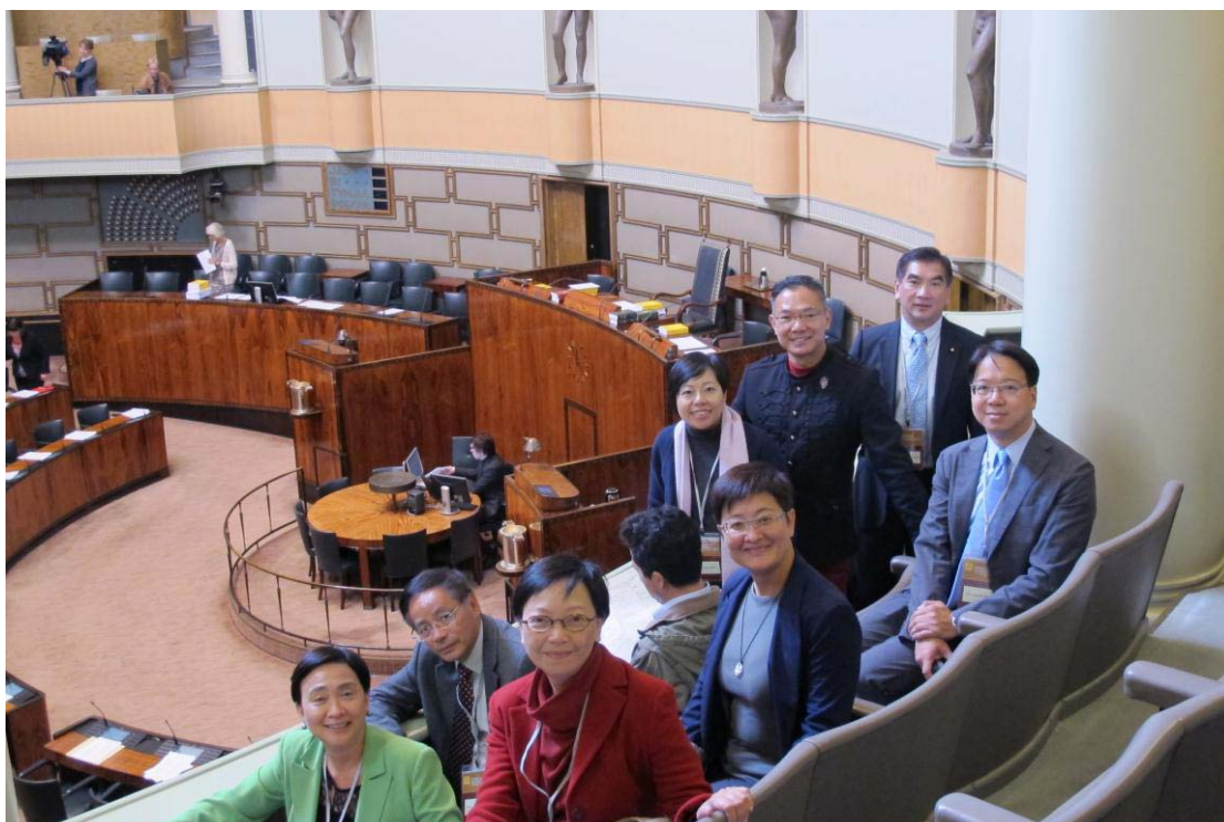
The delegation observed a debate of the Budget Plenary Session in the Chamber of the Eduskunta