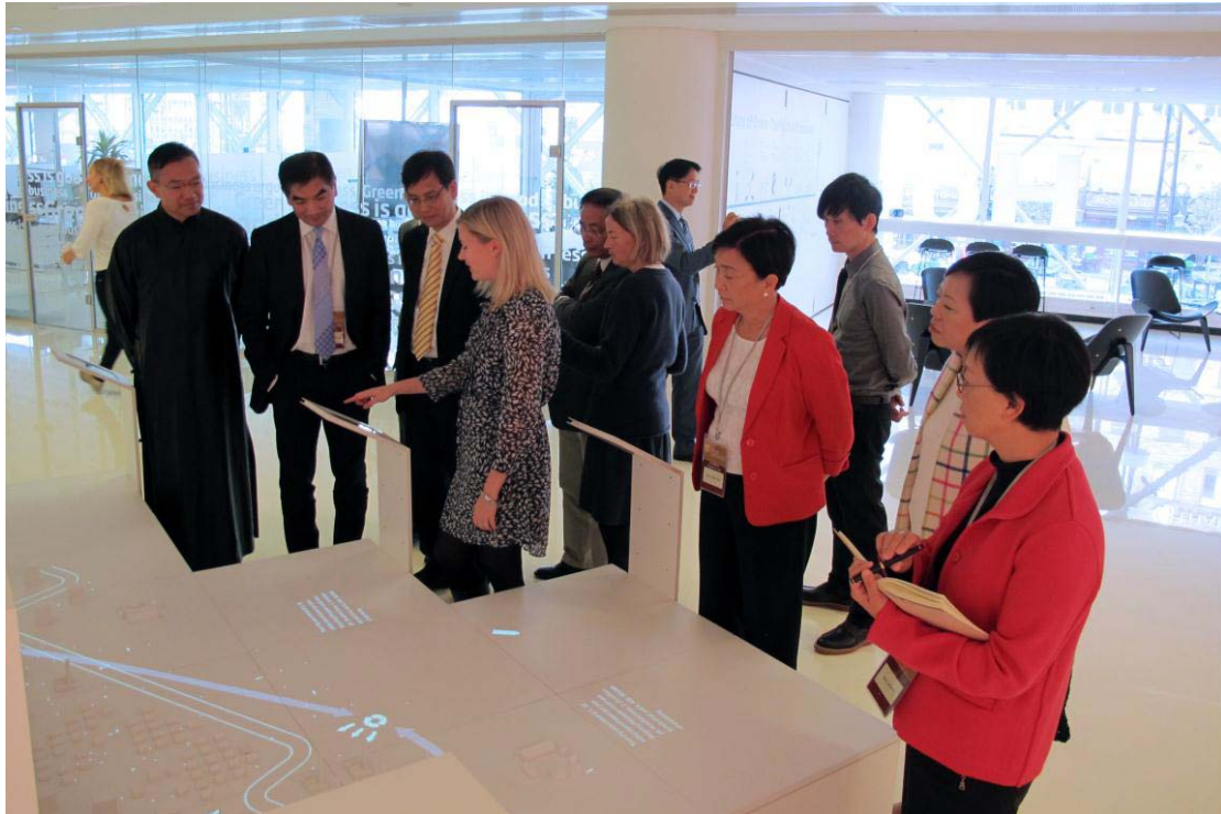
Visit to State of Green