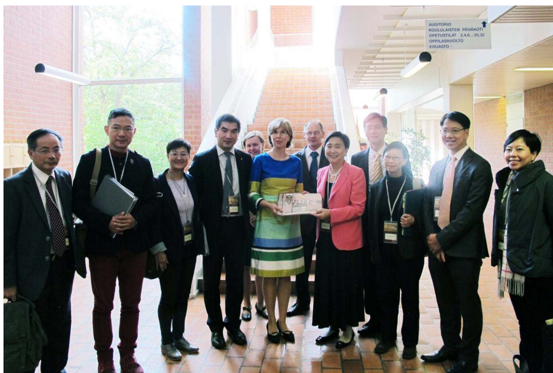
Visit to the Pelimanni Primary School in Helsinki, Finland

2.35 The delegation is pleased to note that a professional teacher force is one of the determining factors attributing to the high level of students' performance across the Finnish schools. In Finland, teachers enjoy great respect and trust as the Finns regard teaching as a prestigious profession akin to medicine and law. Finnish teachers are renowned for their high qualifications: those in early childhood and pre-primary education must have a bachelor's degree while the entry requirement for comprehensive and upper secondary school teachers is a master's degree. The Finnish teacher training programme is also characterized by a research-based curriculum that prepares teachers in content, pedagogy and educational theory, and the capacity to conduct their own research and develop creative pedagogical solutions for teaching, as well as training for special education so that teachers have the basic knowledge and skills to handle students with special educational needs.