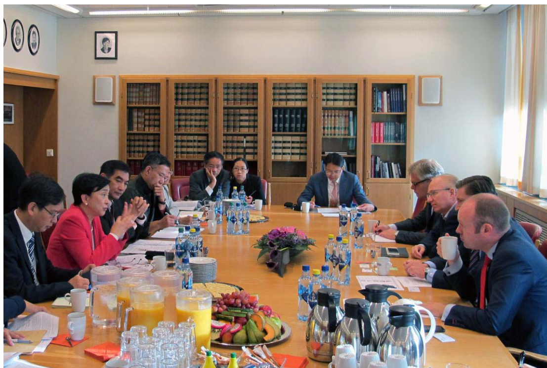
Meeting with parliamentarians from the Progress Party

3.20 As advised by Mr Erik SKUTLE, member of the Conservative Party, Norway is considered to be one of the most gender equal countries in the world. Women in Norway were given the right to vote in 1913, and since then women's participation in democratic processes has increased progressively. From then onwards, campaigns have been held to increase the proportion of women in politics. According to Mr SKUTLE, some political parties have introduced gender quotas in the parliamentary election. For example, the Labour Party, the Socialist Left Party, the Centre Party and the Christian Democratic Party have introduced voluntary quotas ranging from 40% to 50% for both sexes on electoral lists. As regards the Labour Party, there must be a 50% quota for both sexes which shall be represented in the first two positions. In 2013, women gained 39.6% of the seats in the Storting.