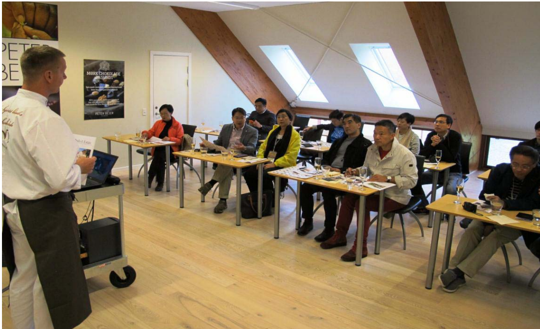
Briefing by Peter Beier Chokolade, a chocolate manufacturer in Copenhagen