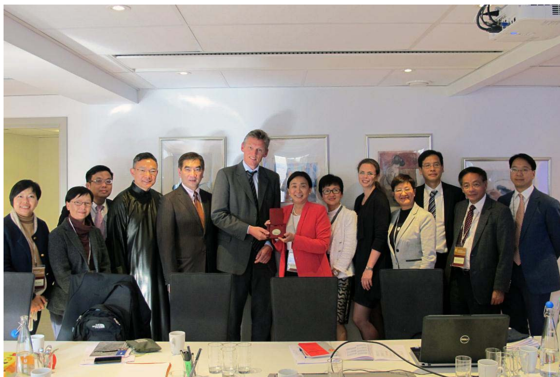
Visit to the Office of Parliamentary Ombudsman

3.46 The delegation has also noted that at the end of 2013, the OPO had 38 legal case workers, spread across the five divisions that dealt with complaints, and an administrative support apparatus totaling 13 persons. In 2013, 2,942 cases were submitted to the OPO. In addition, 45 cases were initiated on the Ombudsman's own initiative. Following a period of significant year-on-year growth in the number of new cases, the influx of new cases has remained stable at around 3,000 per year in the period 2010 to 2013, with a small decline in 2013 compared to the previous year. The number of own-initiative cases increased from 35 in 2012 to 45 in 2013. The time taken by the Ombudsman to deal with a case varies depending on the subject matter of the case, its scale and the kinds of investigations required to ensure that the matter is sufficiently clarified. In 2013, the case-processing time for closed cases was reduced after the issue was raised with the administration following a slight increase in case processing times in 2012.