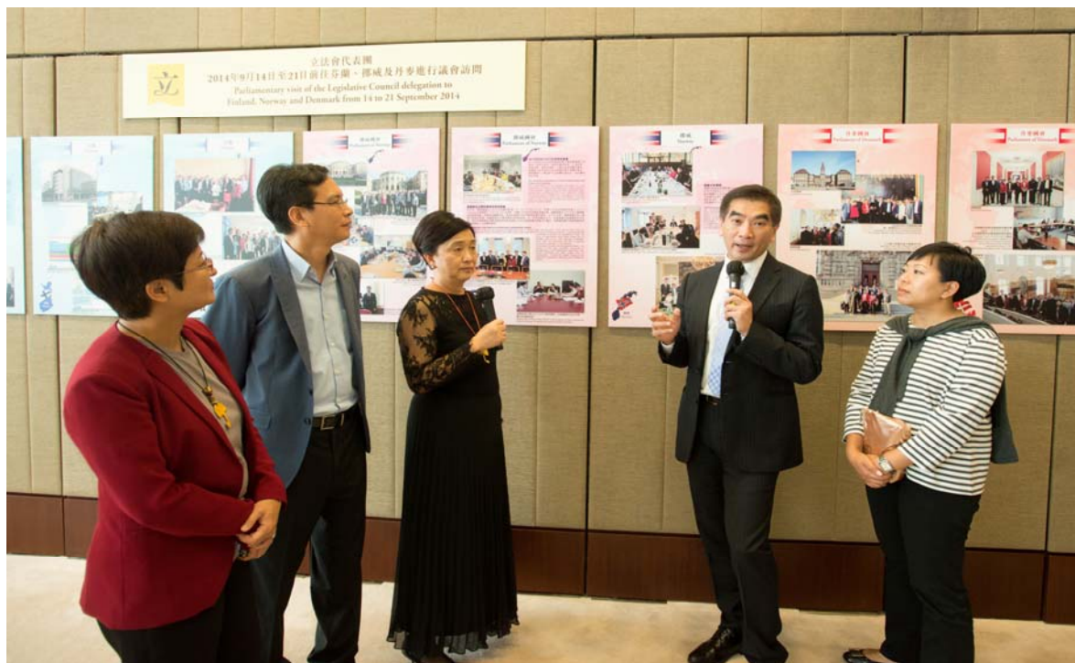
Media briefing by the delegation