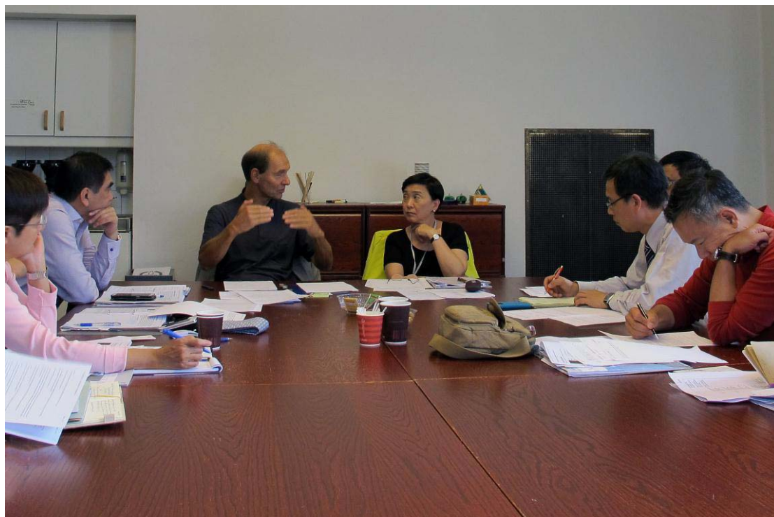
Meeting with Professor Eivind SMITH from the University of Oslo

3.16 The delegation has noted that the Labour Party has dominated Norwegian politics for much of the last 80 years. In the 1981 election, the Labour Party lost its majority, which paved the way for the first post-war Conservative government ruling on its own. Since 1981, Norway was ruled by a succession of minority governments alternating among Labour minority government, Christian Democratic-led government and Conservative-led government. In the run-up to the 2005 election, the Labour Party reached out to the Socialist Left Party and the Centre Party to form the "Red-Green Coalition", which won a total of 87 out of 169 seats and formed the government. The "Red-Green Coalition" was re-elected in the 2009 election and became the first ruling government to win a second consecutive term in 16 years. The coalition retained its narrow majority in the Storting with 86 seats and the Progress Party trailed at 41 seats.