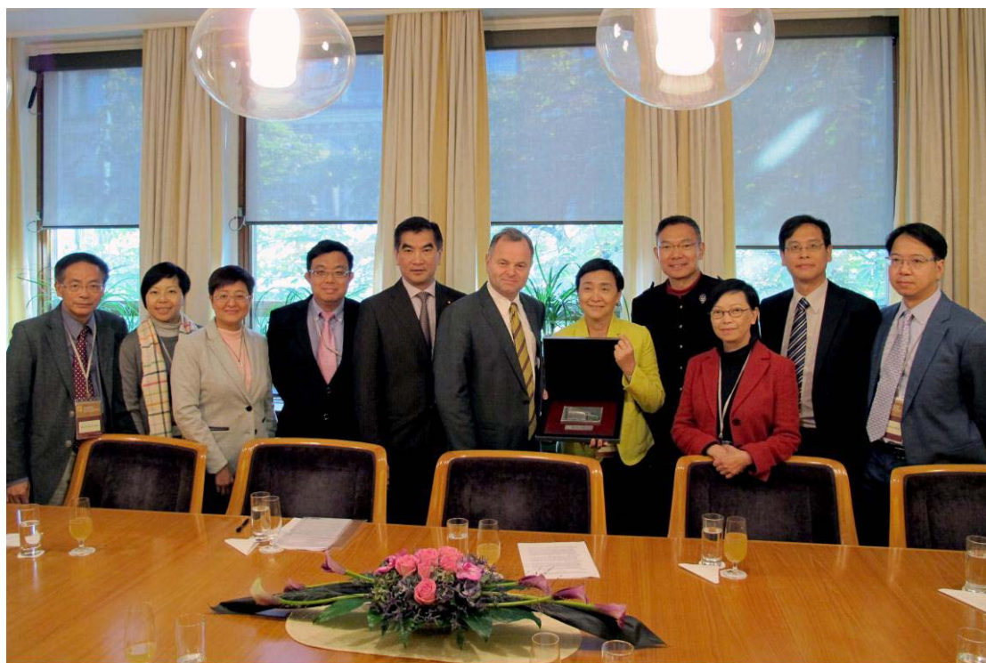
Meeting with Mr Olemic THOMMESSEN, President of the Storting