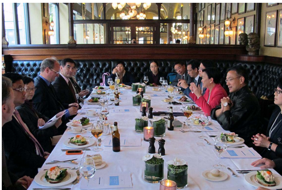
Briefing by the Norwegian Ministry of Finance on the Government Pension Fund Global

3.40 The delegation has also noted that GPFG is an integrated part of the Norwegian Government's annual budget. The government can draw on the fund to boost its annual budget, but the annual withdrawal from GPFG is capped at 4% of the fund's value. The withdrawal corresponds to the expected annual real return of the fund's investments, and is accompanied by a fiscal rule that over time the structural, non-oil budget deficit shall correspond to the real return on the fund. As a result, the annual income generated by GPFG and the government's non-petroleum revenue should be sufficient to achieve an overall budget balance.