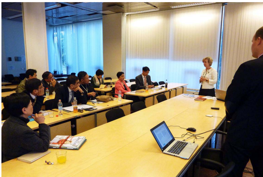
Briefing by the representatives of Tekes

2.39 The delegation is impressed by the fact that R&D expenditure made up 3.6% of Finland's GDP in 2012, which was high by international standards. In 2014, Finland government's total R&D subvention amounted to the equivalent of HK$20 billion, of which 26% was allocated to Tekes.