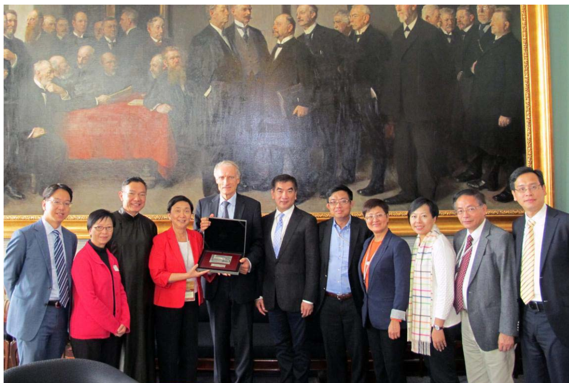
Meeting with Mr Bertel HAARDER, First Deputy Speaker of the Presidium of the Folketing