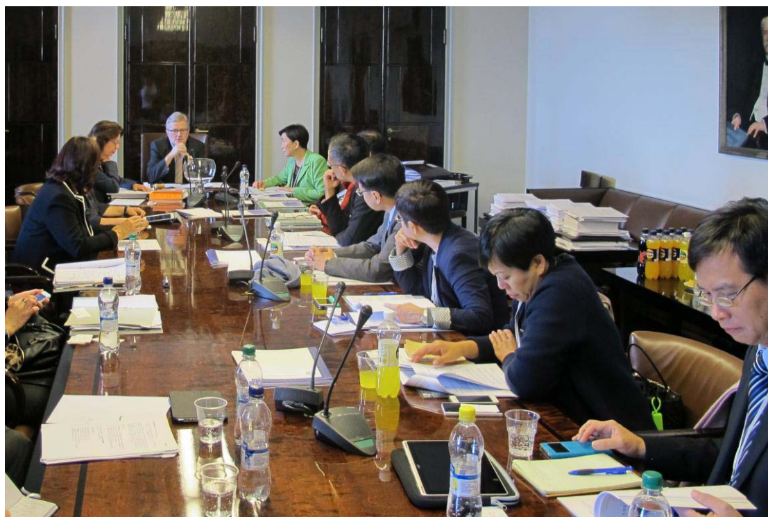
Meeting with the Constitutional Law Committee of the Eduskunta