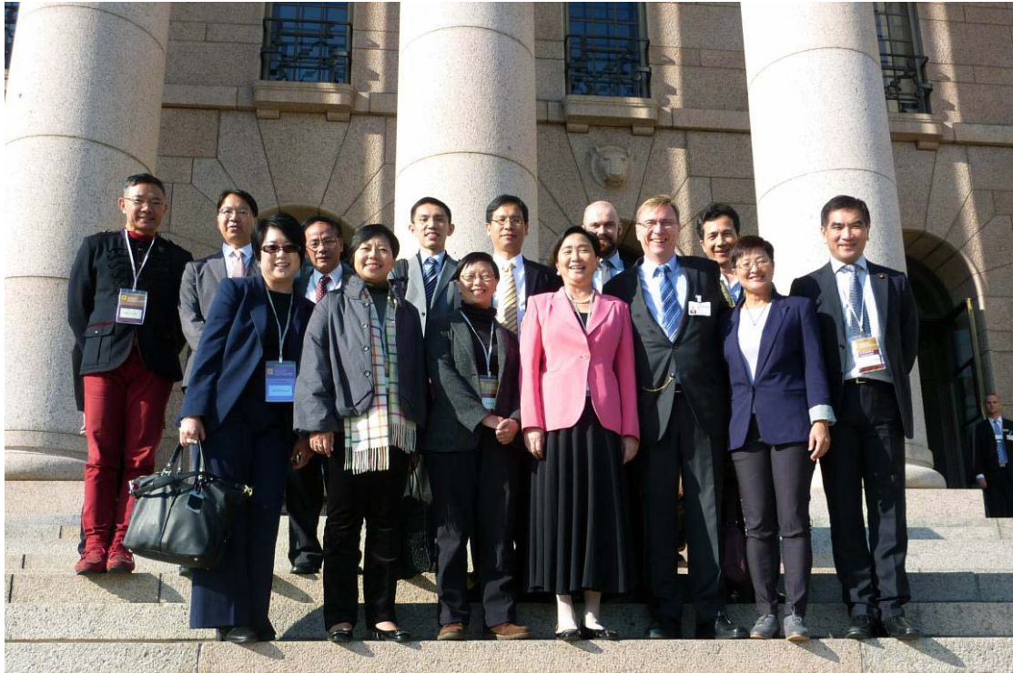
Visit to the Eduskunta building

technology have placed challenges on the renovation project launched in 2006. A new renovation project will start in 2015 and the Eduskunta will move to temporary facilities. The renovation of the Eduskunta building is scheduled for completion in time to celebrate the centennial of the independence of Finland in 2017.