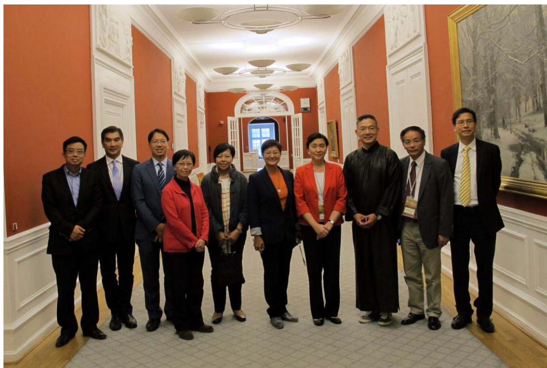
Visit to Christiansborg Palace, Folketing building

4.28 The delegation has observed that the Third Christiansborg Palace was built in Neo-Baroque style with the highest tower in the city which exceeded 106 meters. The present Christiansborg Palace is separated into two main wings. Half of the Palace houses the Folketing and offices for the MPs, including meeting rooms for the political parties at their disposal. The other half are reserved as residential premises for the Royal Family and Household. The Royal Reception Rooms at Christiansborg Palace are located on the first floor which includes the Great Hall, the Tower Room, the Throne Room, the Audience Chamber, the Council Room, the Fredensborg Room and the Queen's Library. The Folketing and government quarters are situated at the Christiansborg Palace on the south wing occupying three floors of the Palace.