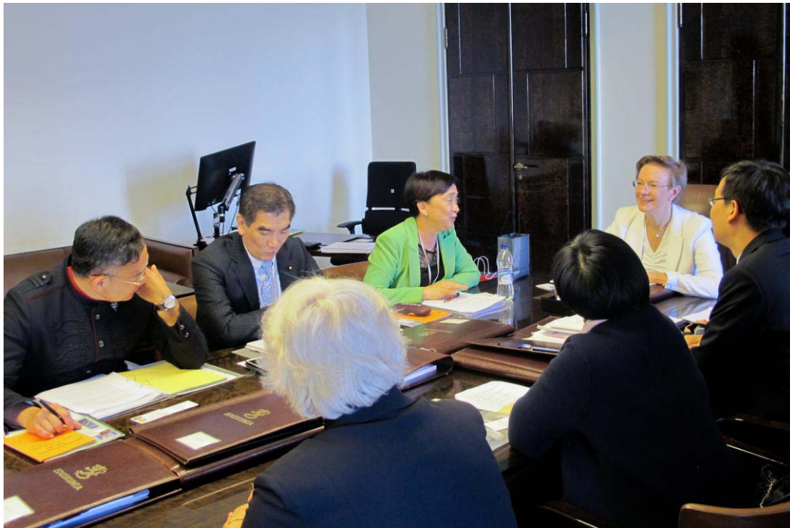
Meeting with Ms Päivi LIPPONEN, Chairman of the Committee for the Future of the Eduskunta

shape in the minds of the 17 parliamentarians elected onto it. The CFTF, which was formed after the elections in March 2007, has chosen to focus on three issues, namely "Finland renewing herself through learning – the challenge of metropolises and new general education", "Taboos of the welfare model – sacred misconceptions", and "Forests and the future of using them". In 2014, the CFTF published various papers, including "Crowdsourced off-road traffic law experiment in Finland - Report about idea crowdsourcing and evaluation", and "Chinese–Finnish Green Growth Cooperation".