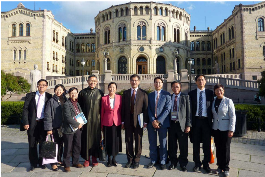
Visit to the Storting building

3.33 The delegation has been told that the Storting building is constructed in yellow brick with details and basement in light gray granite. It is a combination of several styles, including inspirations from France and Italy. A characteristic feature of the Storting building is the location of the plenary chamber in the semi-circular section in the front part of the building, as opposed to the building's centre. The back side of the building mirrors the facade of the front. The interior of the building is also designed by LANGLET.