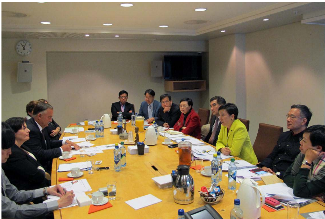
Joint meeting with the Standing Committee on Local Government and Public Administration and the Standing Committee on Scrutiny and Constitutional Affairs of the Storting