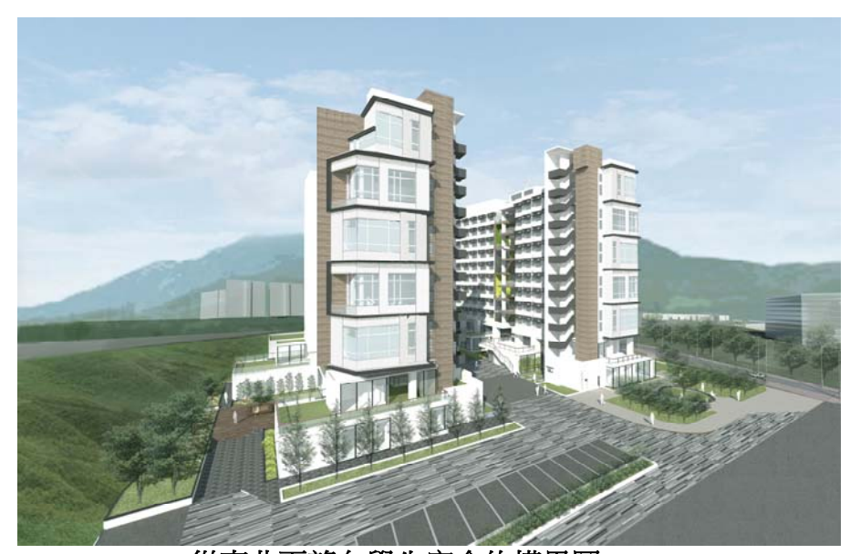
從東北面望向學生宿舍的構思圖 View of student hostel from northeast (Artist's impression)