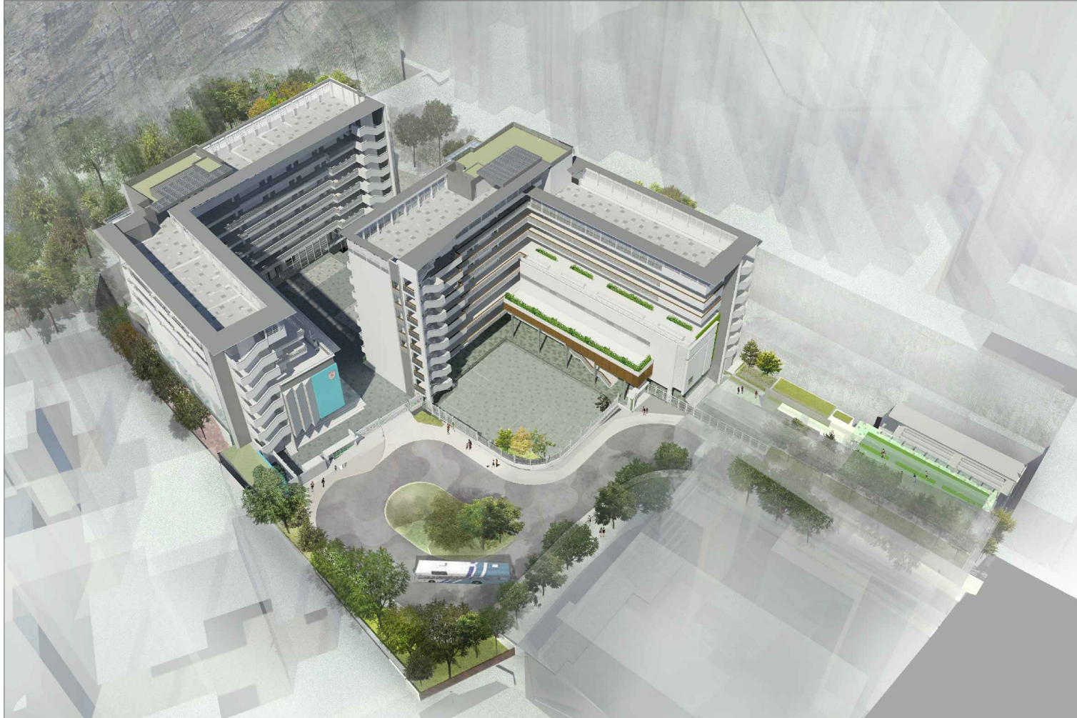
AERIAL VIEW FROM NORTHERN DIRECTION 從北面望向學校的鳥瞰圖