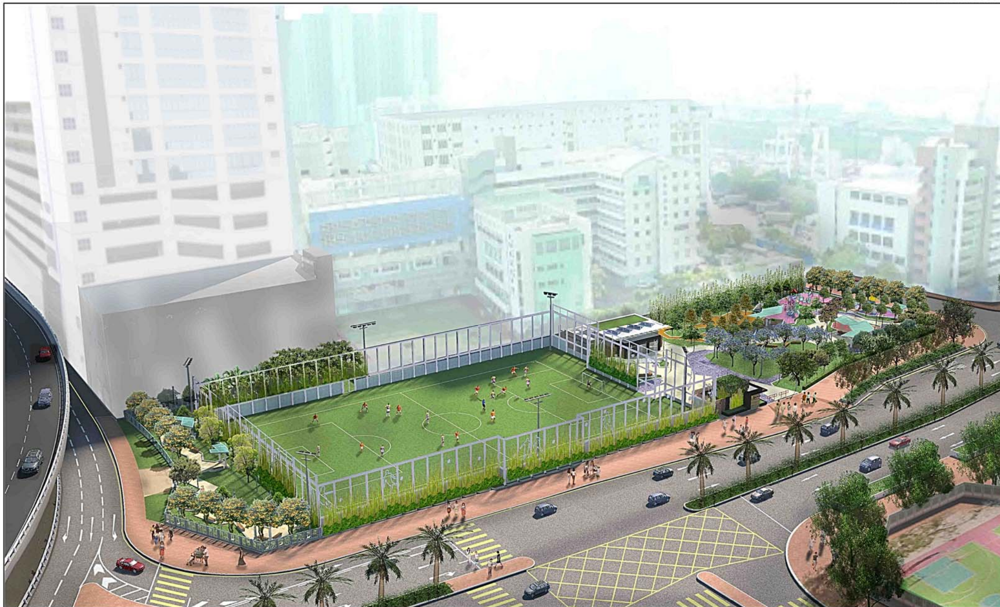
從北面望向休憩用地的構想圖 PERSPECTIVE VIEW FROM NORTHERN DIRECTION (ARTIST'S IMPRESSION)

434RO 深水埗興華街西休憩用地 OPEN SPACE AT HING WAH STREET WEST, SHAM SHUI PO