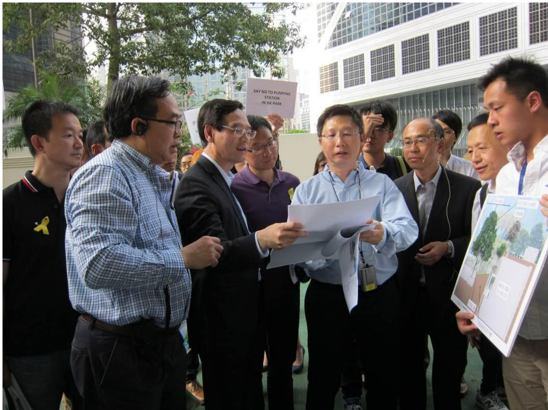
Members are briefed on the Administration's proposal to preserve, transplant or remove the trees near the proposed site.