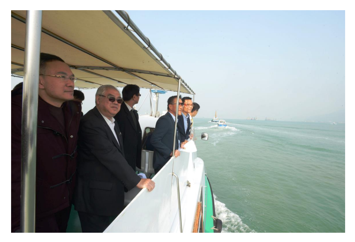
Legislative Council Members take a boat trip to observe the reclamation works of Hong Kong Boundary Crossing Facilities of the Hong Kong-Zhuhai-Macao Bridge.