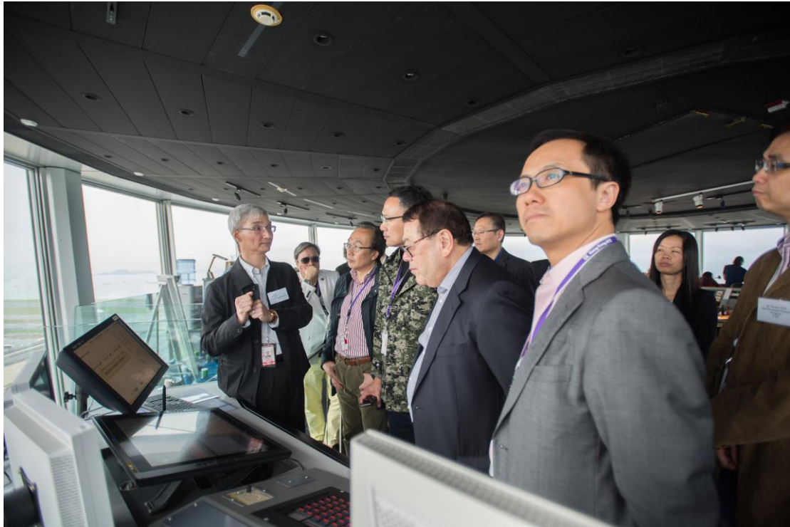
Legislative Council Members visit the Air Traffic Control Tower of the Civil Aviation Department.