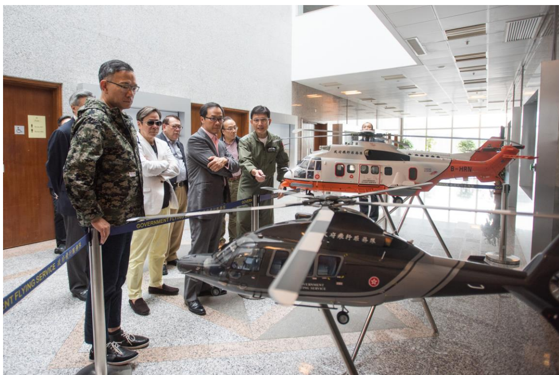
Legislative Council Members visit the Government Flying Service.