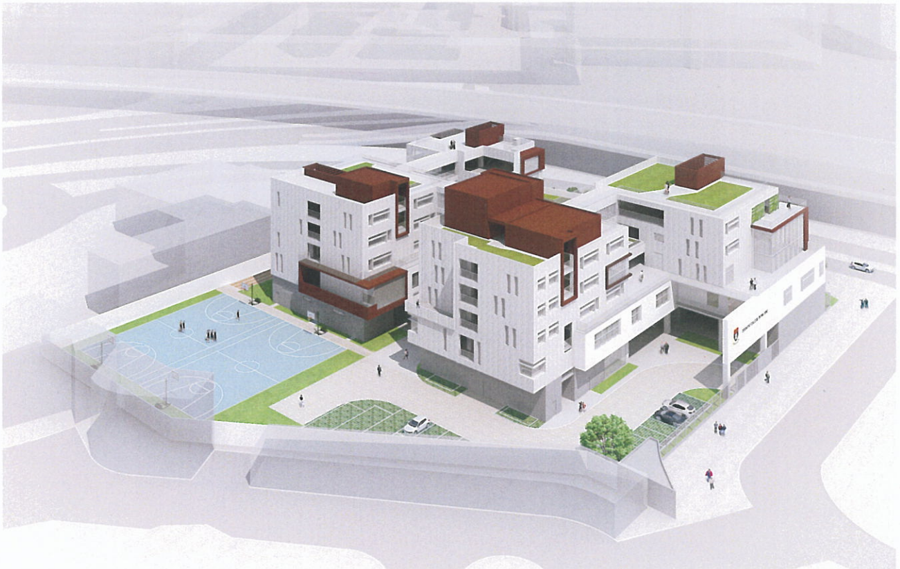
西南面構思圖 PERSPECTIVE VIEW FROM THE SOUTH WESTERN DIRECTION