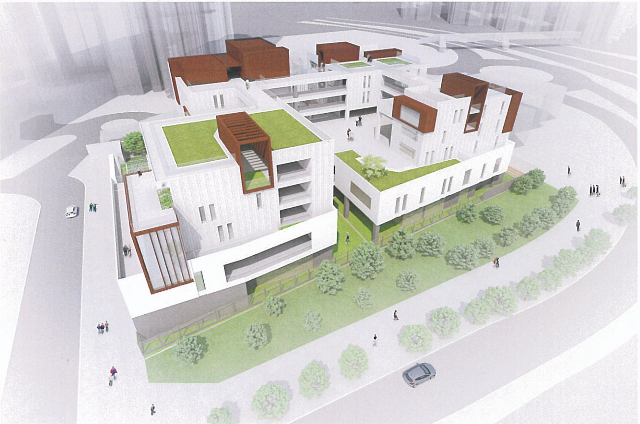
東南面構思圖 PERSPECTIVE VIEW FROM THE SOUTH EASTERN DIRECTION