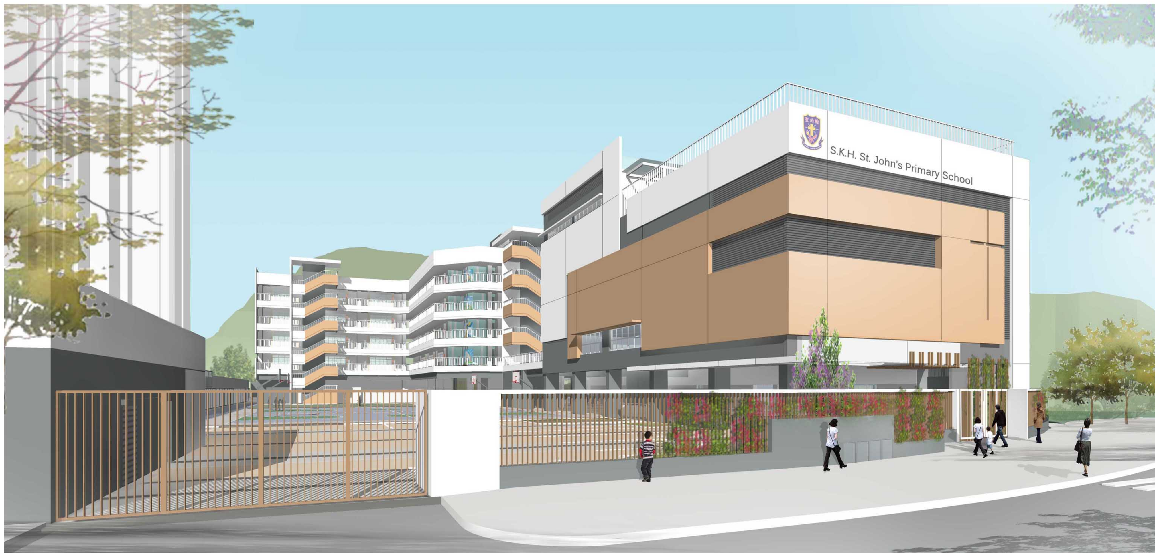
從安翠街望向小學的構思圖 PERSPECTIVE VIEW FROM ON CHUI STREET