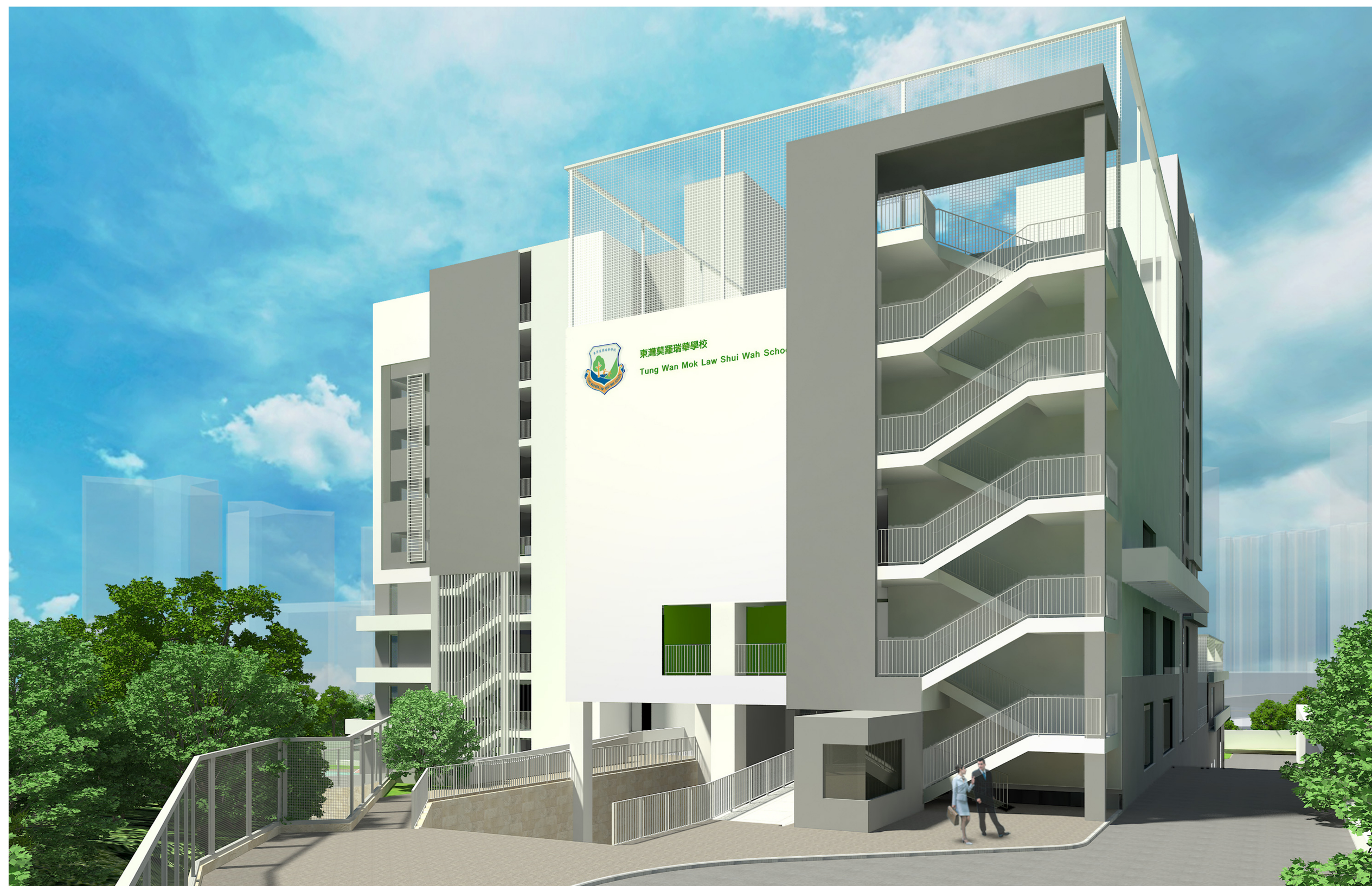
PERSPECTIVE VIEW FROM SOUTH WESTERN DIRECTION 從西南面望向學校的構思透視圖