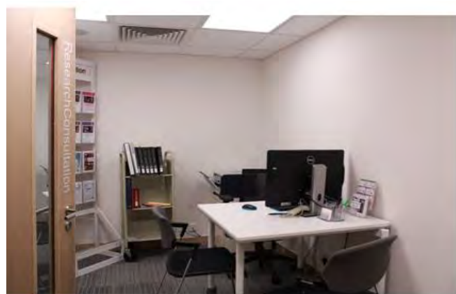
Research Consultation Room (where individual consultation on research work can be provided)