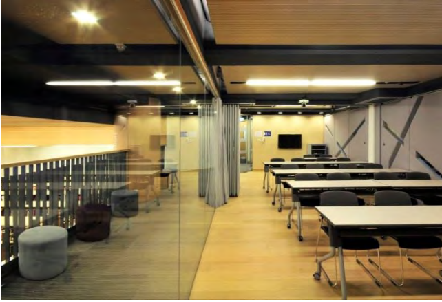
Seminar Room A

Houses three Seminar Rooms, all equipped with information technology, audio and visual equipment for presentation or group discussion with a Learning Commons located next to these facilities.