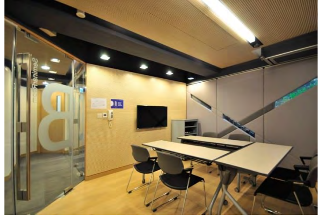
Seminar Room B