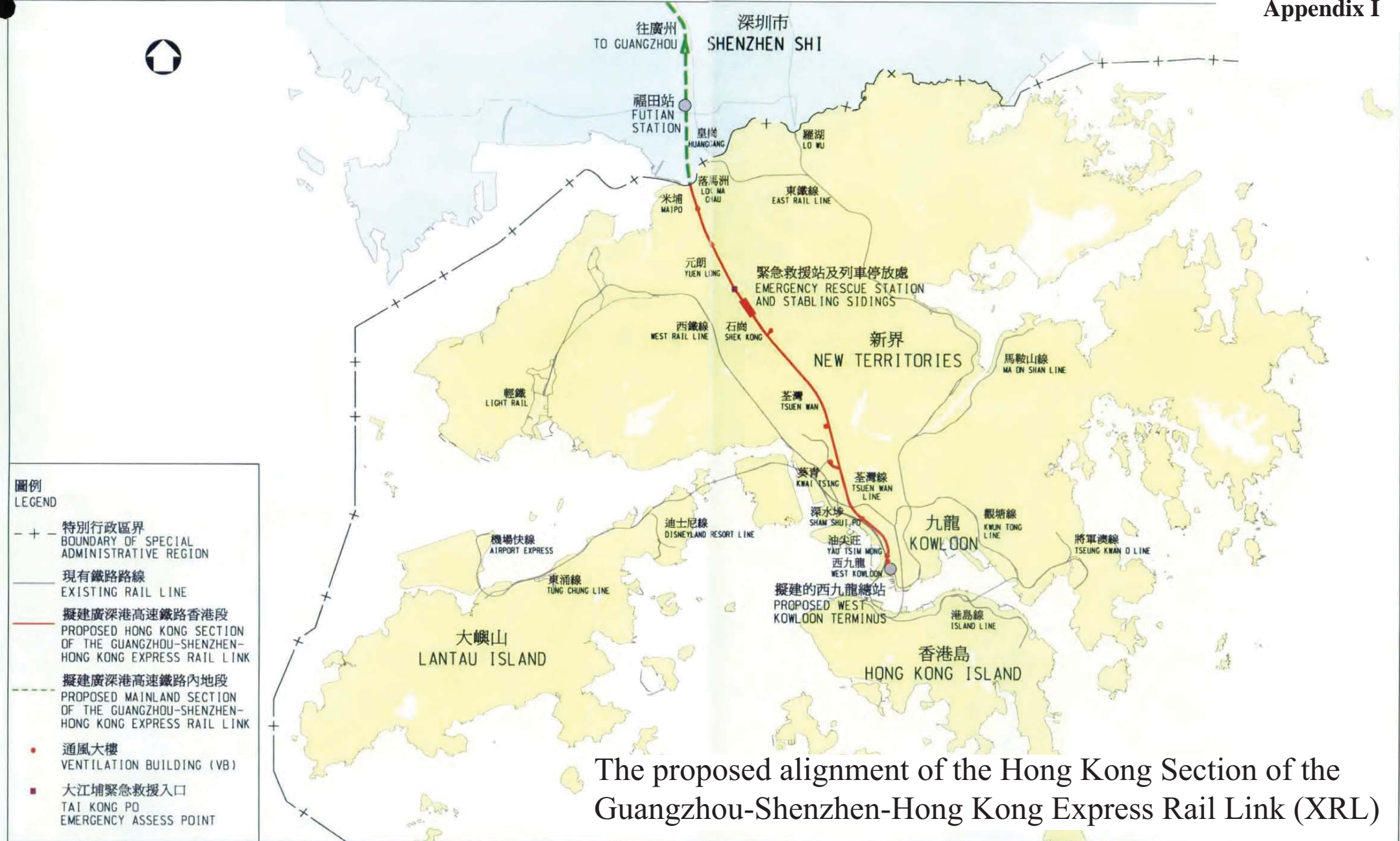
The proposed alignment of the Hong Kong Section of the Guangzhou-Shenzhen-Hong Kong Express Rail Link (XRL)