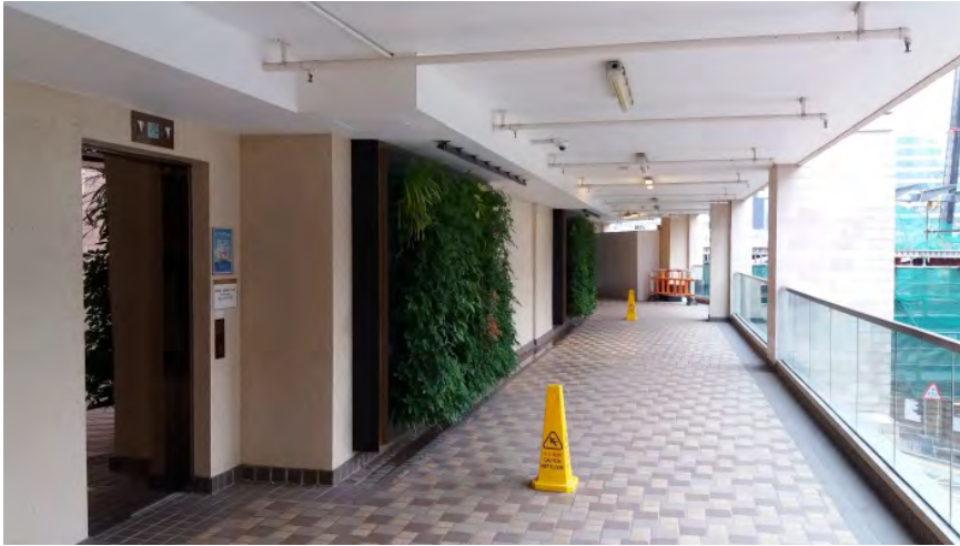
位於觀月·樺峯基座平台的24小時行人連通道 24-hour pedestrian link at the podium of Park Metropolitan