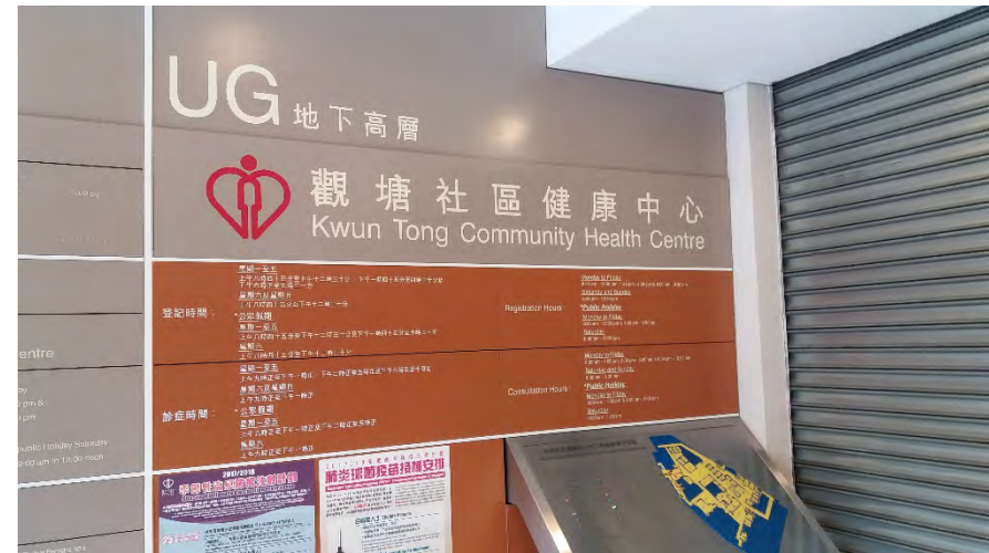
觀塘社區健康中心 Kwun Tong Community Health Centre