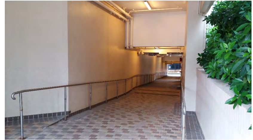
24小時行人連通道通往月華街一帶 24-hour pedestrian link connecting to Yuet Wah Street