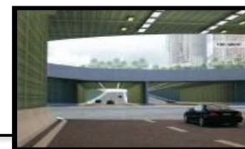
Depressed Austin Road West and Lin Cheung Road junction 低於地面的柯士甸道西與連翔道交匯處