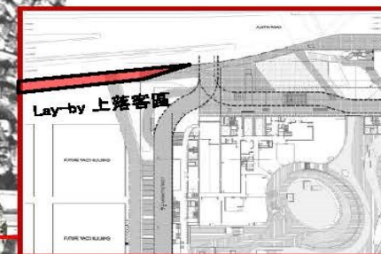
Lay-by at East Gate 東閘路旁上落客區