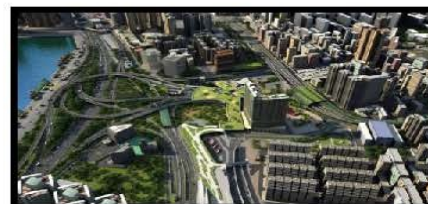
Central Kowloon Route 中九龍幹線