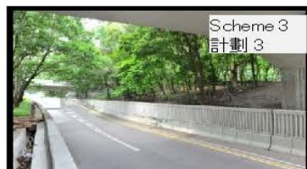
Scheme 3 計劃 3 Proposed single lane at-grade road connecting West Kowloon Highway southbound to elevated Nga Cheung Road 擬建地面單線行車道連接西九龍公路南行方向至雅翔道高架路段