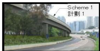
Scheme 1 計劃 1 Proposed single lane elevated road connecting Hoi Po Road to West Kowloon Highway northbound 擬建高架單線行車道連接海寶路至西九龍公路北行方向