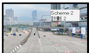
Scheme 2 計劃 2 Proposed single lane elevated road connecting elevated Nga Cheung Road to toll plaza of WHC 擬建高架單線行車道連接雅翔道高架路段至西區海底隧道收費廣場