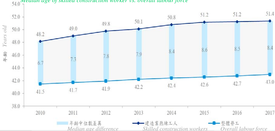
Median age of skilled construction worker vs. overall labour force