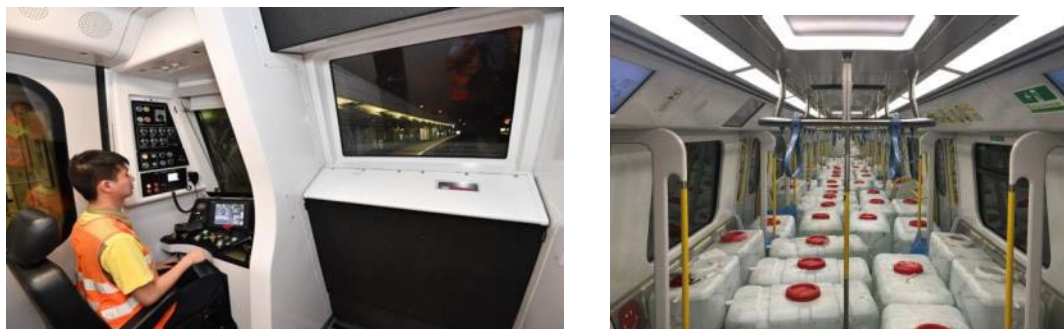
Testing of signalling system along the existing EAL

as restriction of the number of trains in night test would also be in place to minimise the possible noise impacts as possible. The Corporation will continue to communicate with the residents nearby and keep them updated on the information about the night tests.