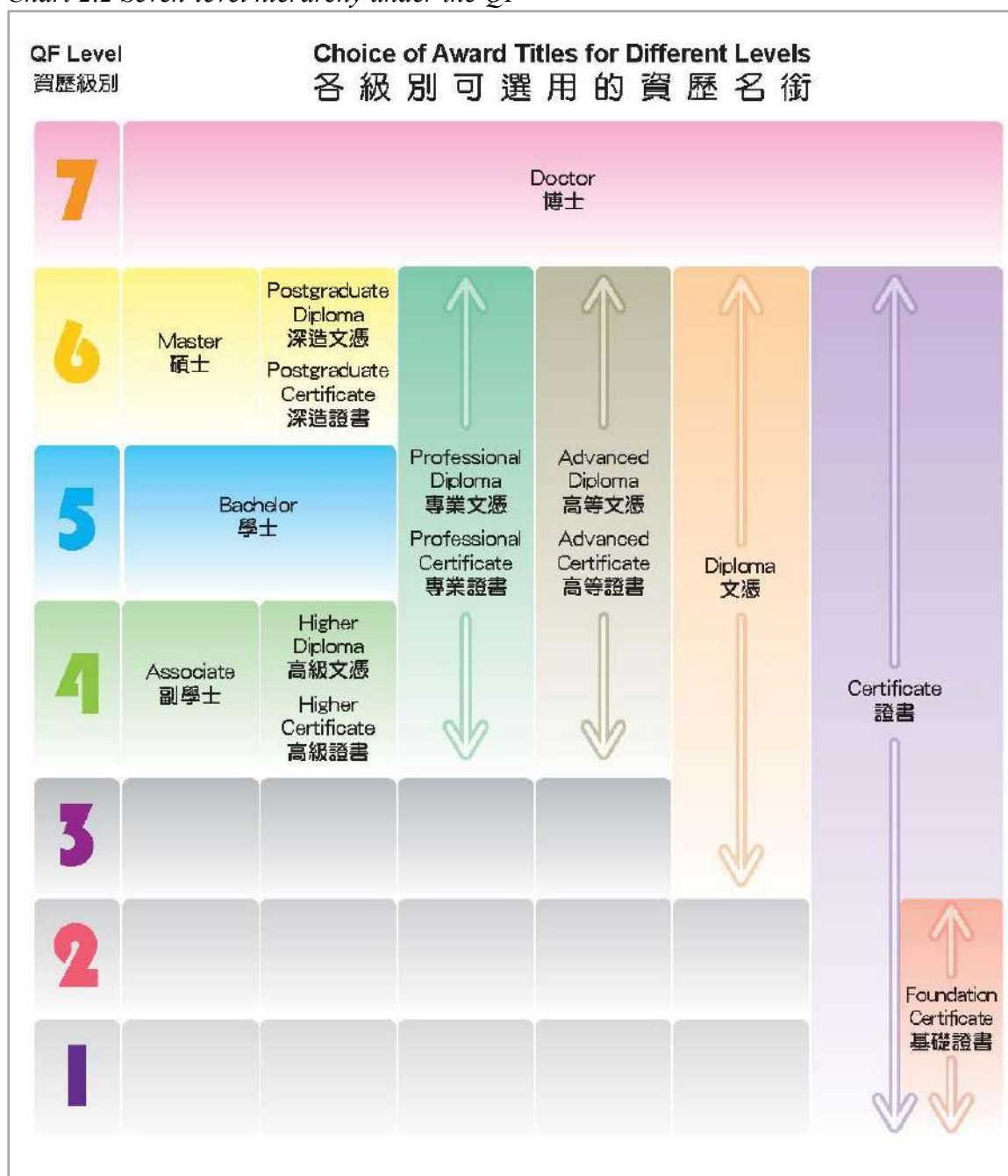
Chart 2.2 Seven-level hierarchy under the QF

2.7. Under the QF, Specifications of Competency Standards (SCSs) are drawn up by different Industry Training Advisory Committees (ITACs), which set out the skills, knowledge, and outcome standards required of employees in different functional areas of the respective sectors, and provide a basis for course providers to design training courses to meet the needs of the sectors. The use of QF credits and the policy and principles for credit accumulation and transfer