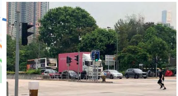
現時平日下午6時的交通狀況 Current traffic condition at 6pm on weekday