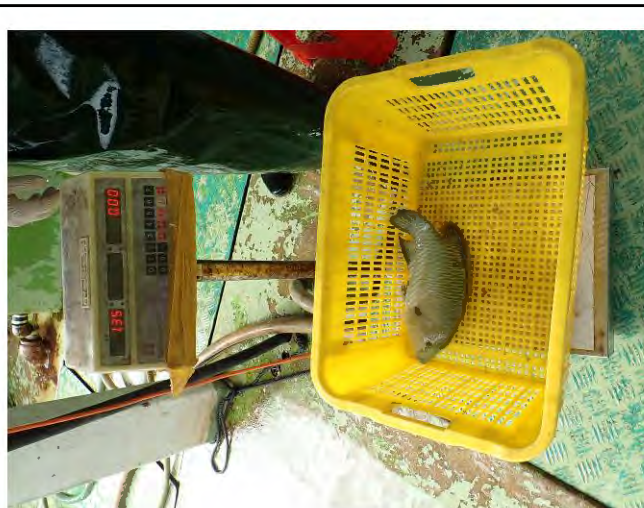
1. The length was 39 cm, 1.35 kg