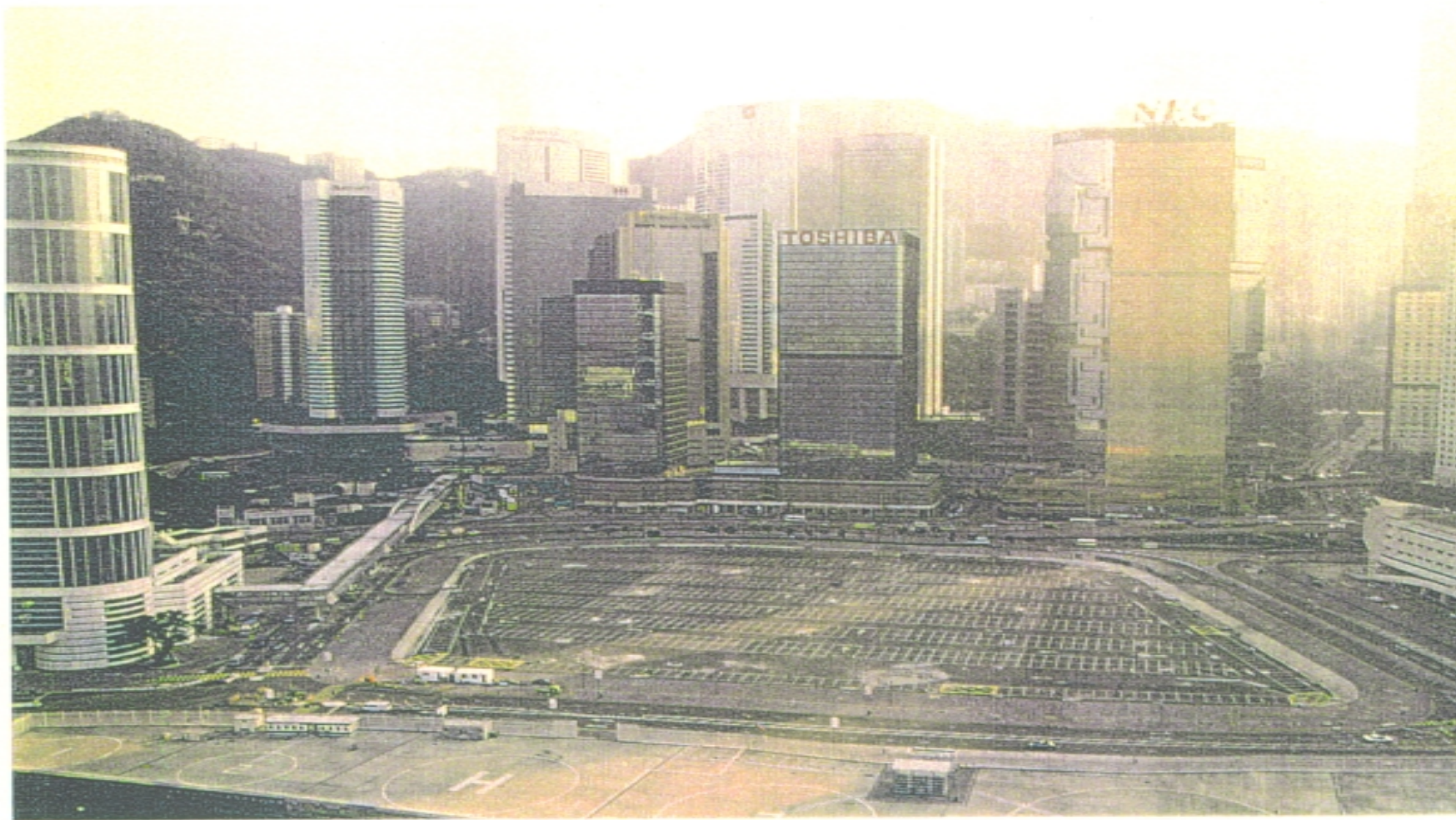
Tamar Basin Reclamation Site 添馬艦基地填海區