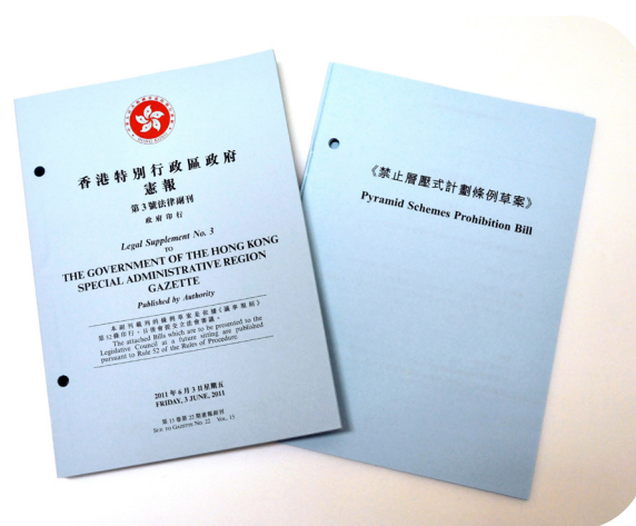
A bill is published in the Gazette.

For a "private bill" 1 , the Member is required to publish the bill in two successive publications of