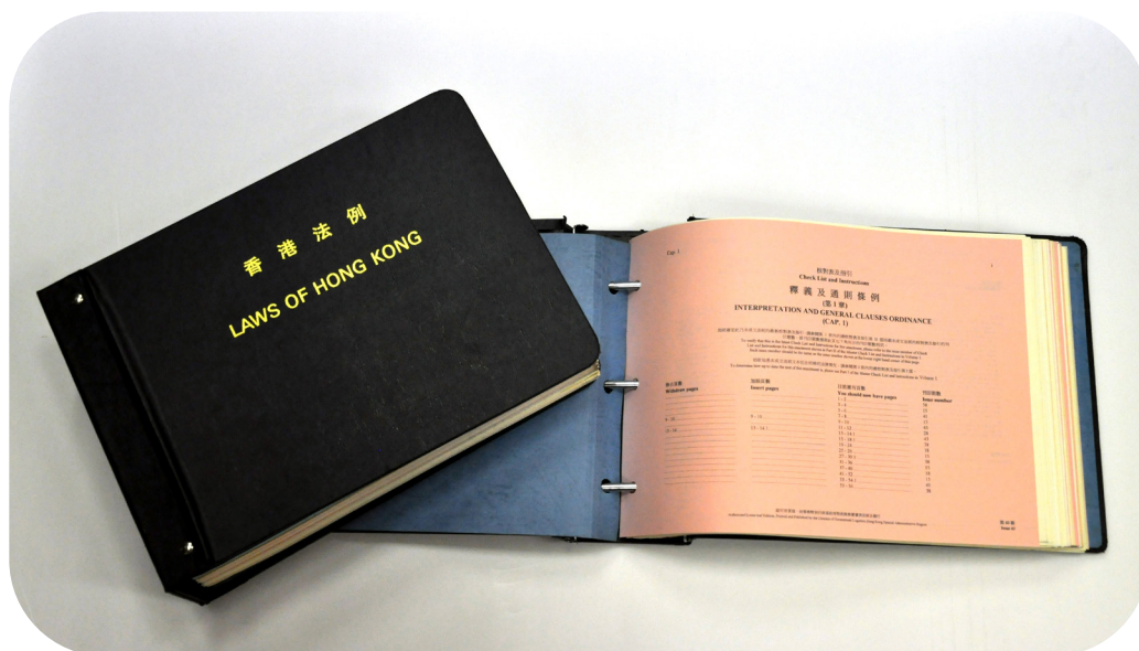
Laws of Hong Kong.

A flowchart illustrating the law-making process is in the Appendix .