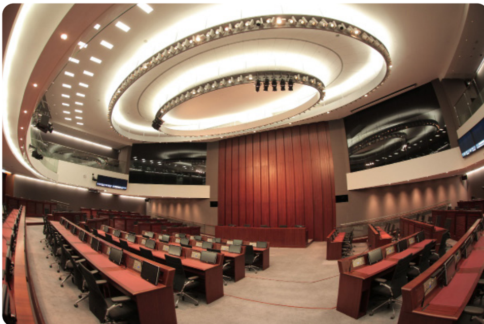
The meetings of the Finance Committee and the House Committee are normally held in Conference Room 1.

Following public hearings, the Public Accounts Committee will compile a committee report listing its conclusions and recommendations and table the report at the Legislative Council.