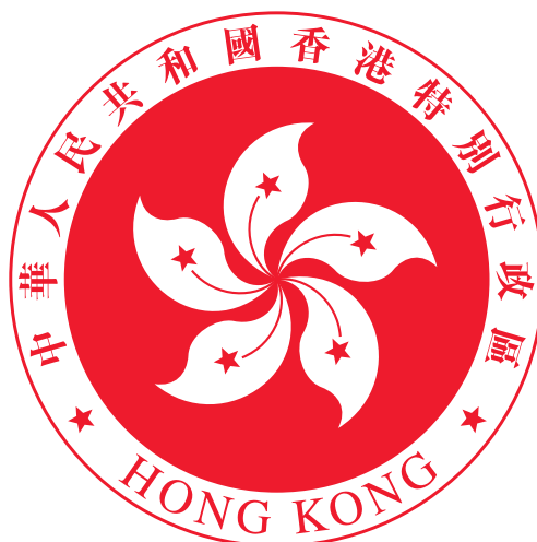
The Design of the Regional Emblem of the Hong Kong Special Administrative Region