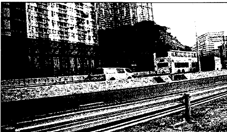
Figure 1 Noise barrier with insufficient height at Cheung Ching Estate