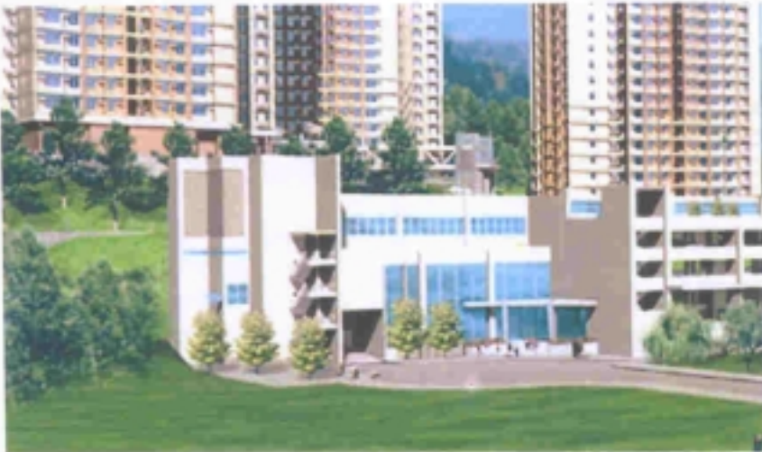
從北面拍攝的建築物模型圖 VIEW OF BUILDING MODEL FROM NORTH DIRECTION