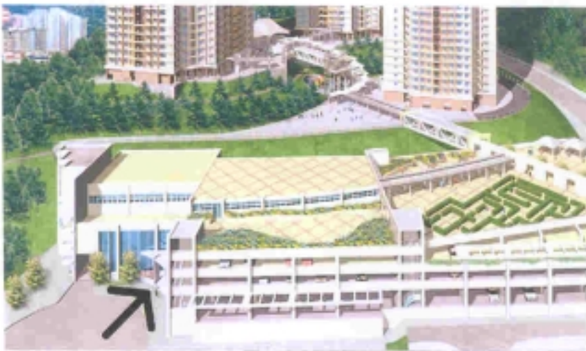
從西北面拍攝的建築物模型圖 VIEW OF BUILDING MODEL FROM NORTH-WEST DIRECTION