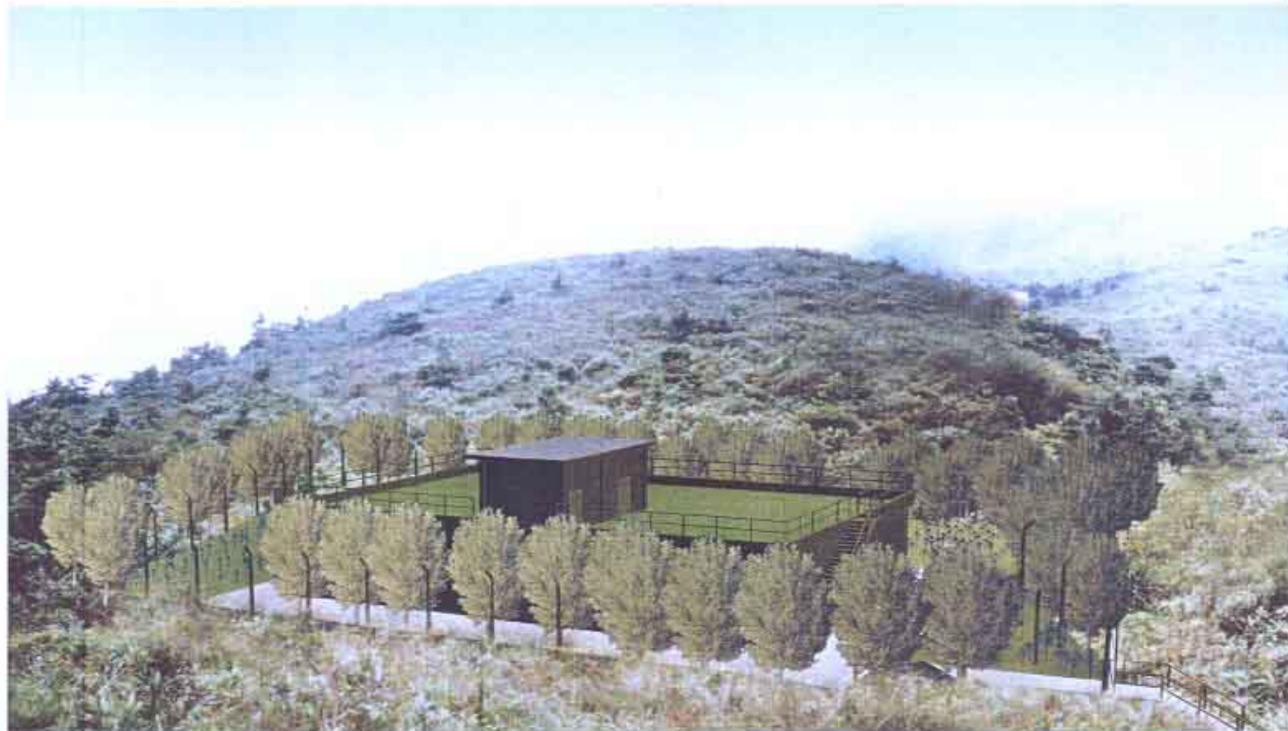
擬建的昂坪食水缸透視圖 PERSPECTIVE DIAGRAM OF PROPOSED NGONG PING FRESH WATER TANK