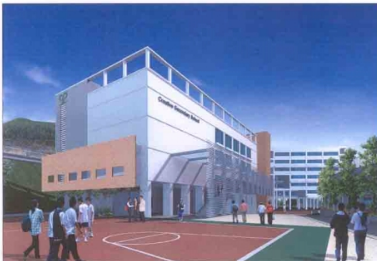
從北面望向中學校舍的構思圖 VIEW OF THE SECONDARY SCHOOL PREMISES FROM NORTHERN DIRECTION (ARTIST'S IMPRESSION)