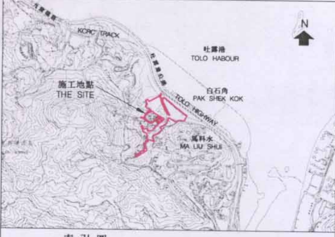
索引圖 KEY PLAN 比例 SCALE 1:50 000