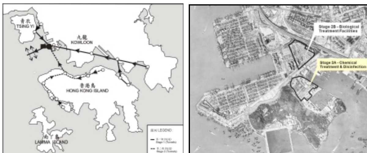
Figure 1 The Preferred Option for HATS Stage 2