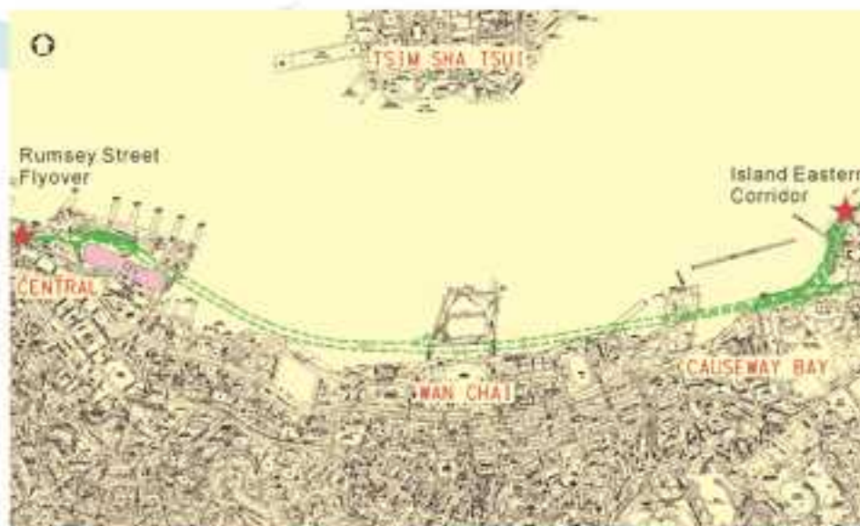
Alignment of the proposed Central - Wan Chai Bypass