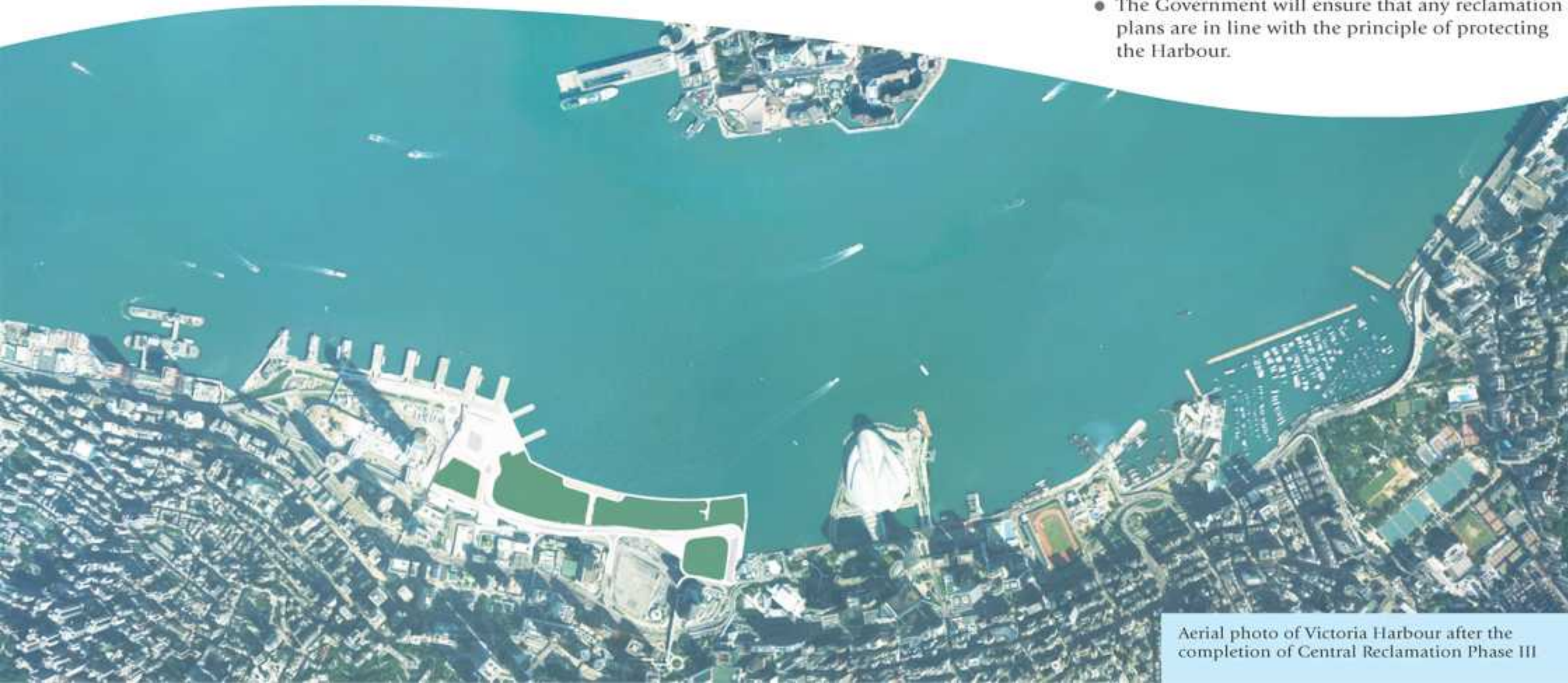
Aerial photo of Victoria Harbour after the completion of Central Reclamation Phase III