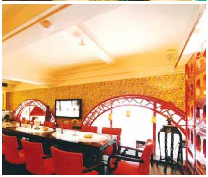
雪茄品嚐區 Smoking area