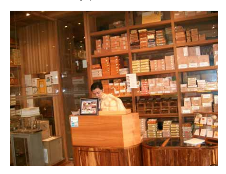
雪茄品嚐區 Smoking area