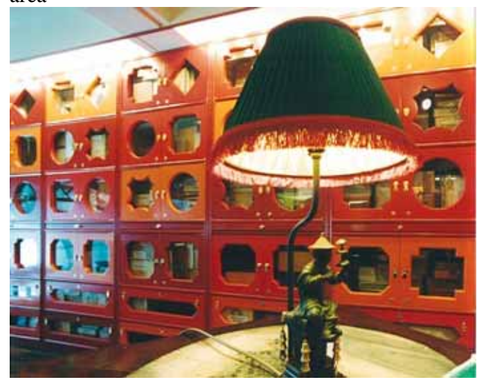
雪茄儲存柜 Cigar Lockers