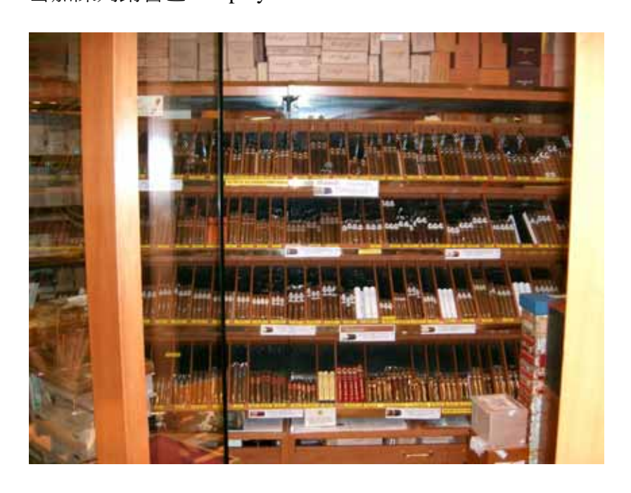
雪茄品嚐區 Smoking area